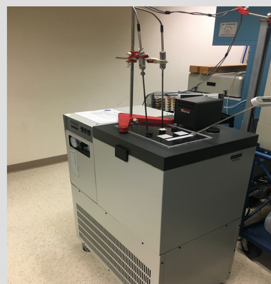
Figure 6 Fluke Hart 7081 Temperature Bath