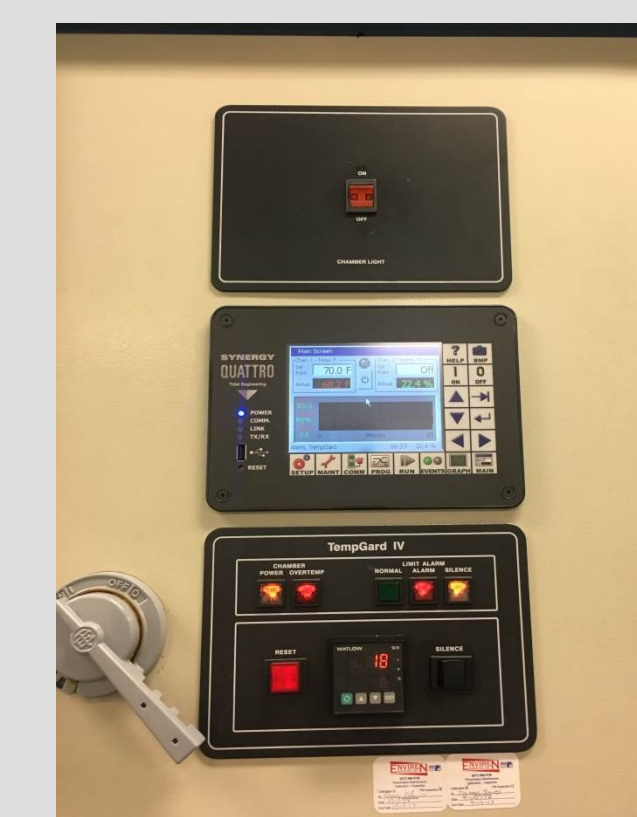
Figure 8 Tenney WITR Environmental Chamber Quattro Controller