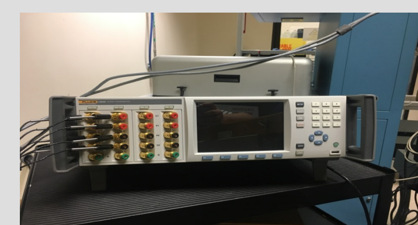
Figure 5 Fluke Hart 1594A Super Thermometer Measuring Unit