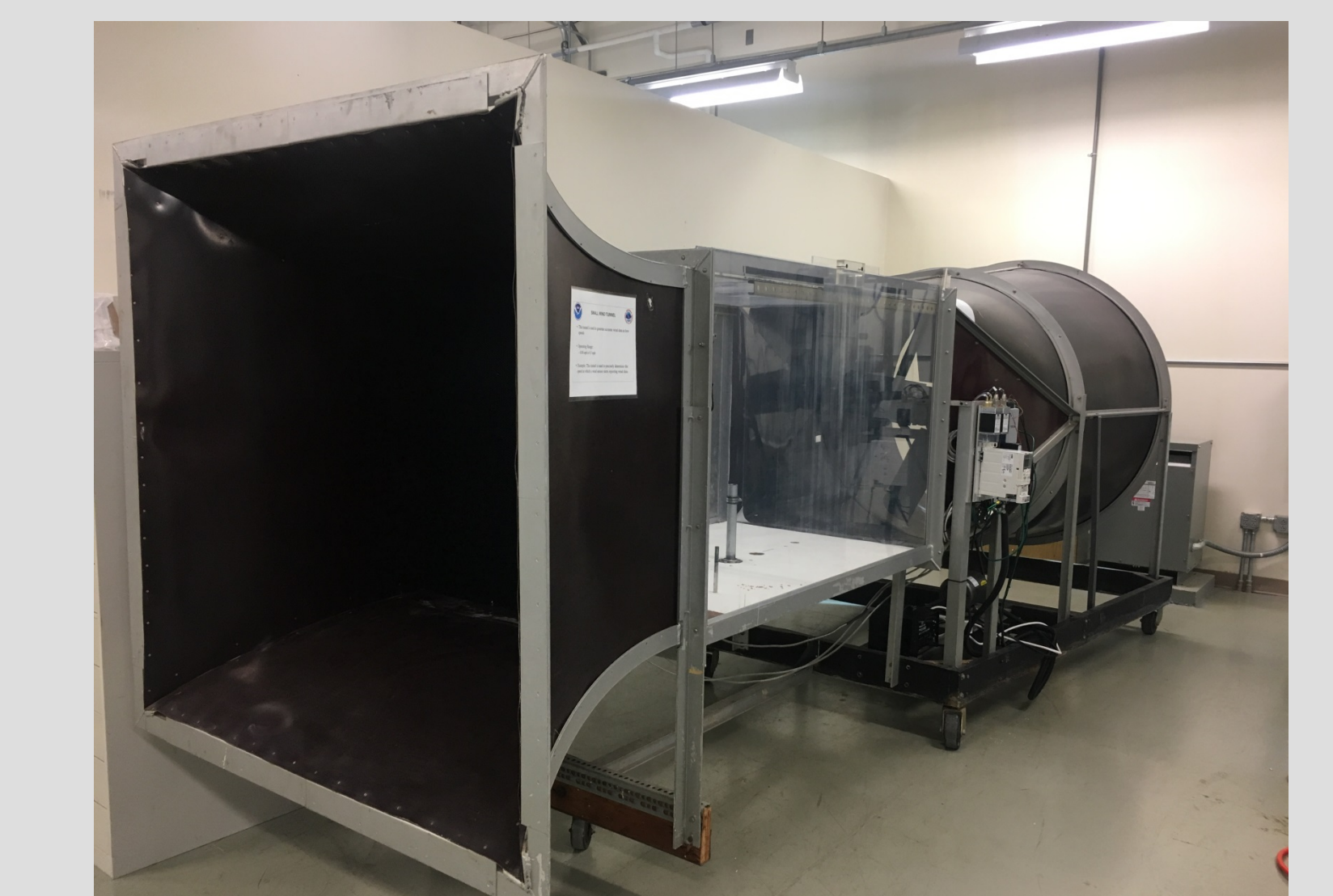
Figure 10 Low Speed Wind Tunnel