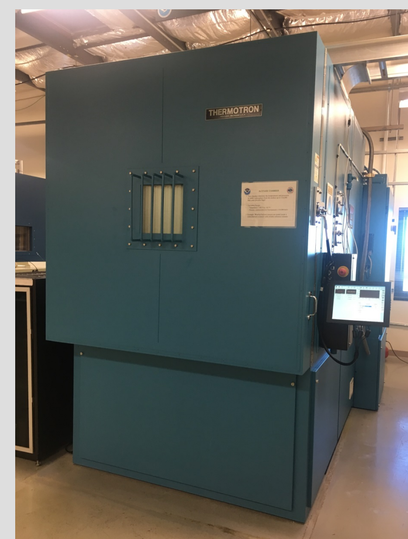
Figure 7 Thermotron Altitude Chamber