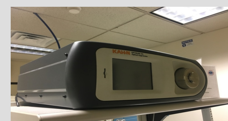
Figure 4 Kahn Optisure RS80 Hygrometer