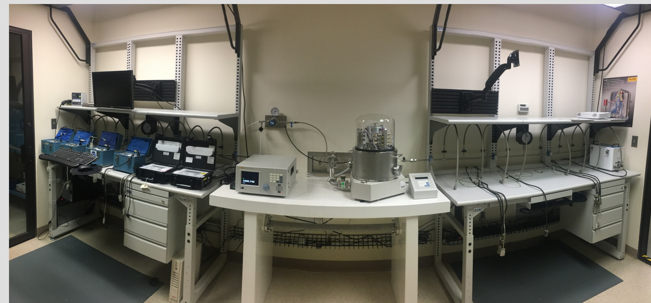
Figure 2 Pressure Lab Set-up