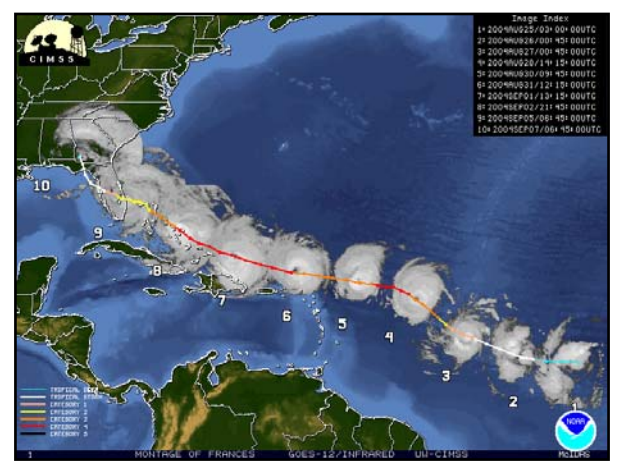
Figure 6. Hurricane Francis mosaic, storm track and satellite (CIMSS, 2004).

Hurricane Frances continued its west-northwest track making landfall over the southern end of Hutchinson Island, approximately 80 nautical miles south of Launch Complex 36, on 5 Sep, 0030 EST, as a Category II hurricane (Figure 6). Wind probability forecasts during the five consecutive launch attempts were critical in supporting the payload community's decision to continue launch attempts or to plan for destack prior to winds exceeding destack constraints and forcing the payload to remain on the pad. AC-167 successfully launched on Tuesday, 31 August 2004 at 1917 EST. Eastern Range assets were secured and personnel evacuated on Thursday, 2 September 2004.