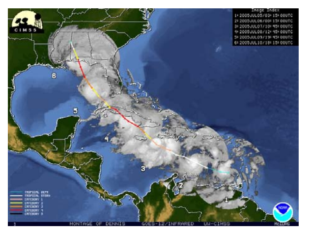
Figure 4. Hurricane Dennis mosaic, storm track and satellite (CIMSS, 2004).

threat and earliest possible arrival of damaging winds. At midnight, Thursday night, 7 July, shuttle managers decided to stop rollback preparations and remain at the launch pad as the storm passed to the west. Hurricane Dennis passed 280 nautical miles west of KSC, and Complex 39B received 32 knots peak wind (Figure 4). In this case, detailed weather updates from the 45 WS and the latest information from the NHC enabled the shuttle program to prevent a schedule slip and avoid incurring additional risks of rolling back a vehicle.