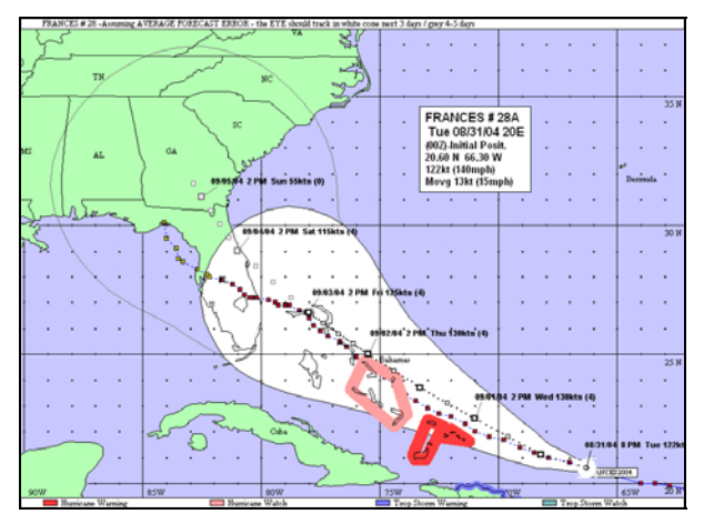
Figure 5. Hurricane Frances. NHC Advisory during the launch of Atlas-Centaur 167. The launch occurred after several days of launch scrubs, with Hurricane Frances becoming more of a threat to the vehicle on the launch pad each day.

For the fifth launch attempt on Tuesday, 31 August, the forecast called for a gradual transition from the unfavorable flow regime with late east coast thunderstorms to easterly flow favoring thunderstorm activity over the interior and west coast. Through the countdown, steering flow gradually shifted from southwesterly to southerly. Although significant convection occurred over the mainland, the southerly steering flow and the easterly anvil-level flow held thunderstorms and associated anvils just outside of 20 nautical miles through the countdown with no weather constraint violations. Hurricane Frances was approximately 950 nautical miles east-southeast of CCAFS as AC-167 launched (Figure 5), the likely final attempt before a destack decision was required.