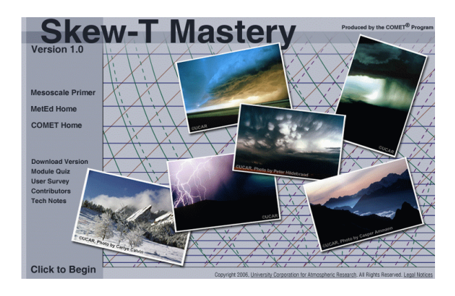
Fig. 1: Main page of the Skew-T Mastery module.

The Cooperative Program for Operational Meteorology, Education and Training (COMET®) has developed a web-based interactive Skew-T. log-p module for meteorology education and training. The Skew-T Mastery module (Figure 1) was primarily funded by the Air Force Weather Agency and is intended to replace their reliance on the widely-used hardcopy version of the Air Force Skew-T manual (Air Weather Service, 1990). Besides the benefits to operational forecasters in the Air Force and other agencies, we anticipate a great deal of interest from instructors teaching university undergraduate meteorology courses. This module is freely available to the atmospheric science community via the MetEd website: http://meted.ucar.edu/mesoprim/skewt/