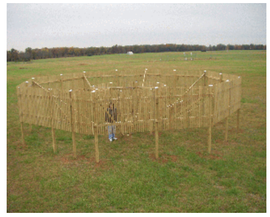
Figure 2 DFIR

A DFIR containing an AWPAG with a Tretyakov shield (AWPAG DFIR) was the reference sensor for this test. The DFIR (Figure 2) consists of two vertical, concentric octagonal fences, with the outer fence measuring approximately 40 feet from apex to apex (diameter), and the inner fence measuring approximately 13 feet from apex to apex. The top of the outer fence is 108 inches above grade and the top of the inner fence is 88 inches above grade. Both fences use 60-inch long vertical slats configured for 50% porosity. One AWPAG with a Tretyakov shield was installed inside a DFIR at the test site.