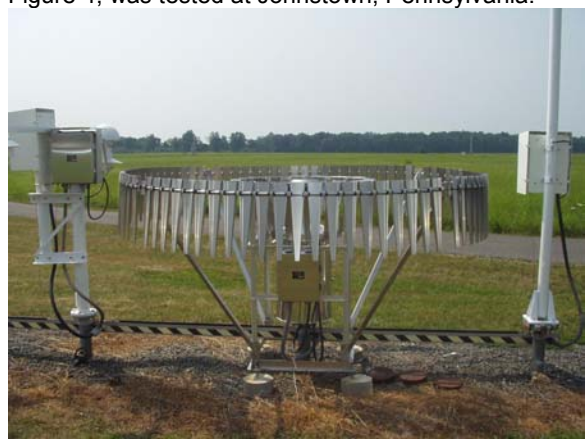
Figure 3 AWPAG Treyakov Alter (OTT)

In addition to testing an AWPAG with a Tretyakov shield, two additional AWPAG's with a Tretyakov shield inside an 8-foot diameter Alter shield, one manufactured by OTT Hydrometry as shown in Figure 3 and one manufactured by the Atmospheric Turbulence Diffusion Division (ATDD), as shown in Figure 4, was tested at Johnstown, Pennsylvania.