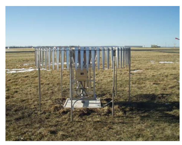
Figure 4 AWPAG Treyakov Alter (ATDD) 3.0 TEST METHODOLOGY AND DATA ANALYSIS

The purpose of this test was to develop and validate a transfer function that provided a correlation between the reported precipitation of the production AWPAG with the 8-foot outer Alter shield and the AWPAG DFIR. This was accomplished by applying a transfer function to the initial accumulation. The transfer function was originally developed by the World Meteorological Organization (WMO), but was modified for use with the 8-foot outer alter. A second transfer function was developed by using a Least Squares Regression. The goal of this test was to improve catch in wind-driven snow conditions using a shield which could be installed around the production AWPAG on ASOS.