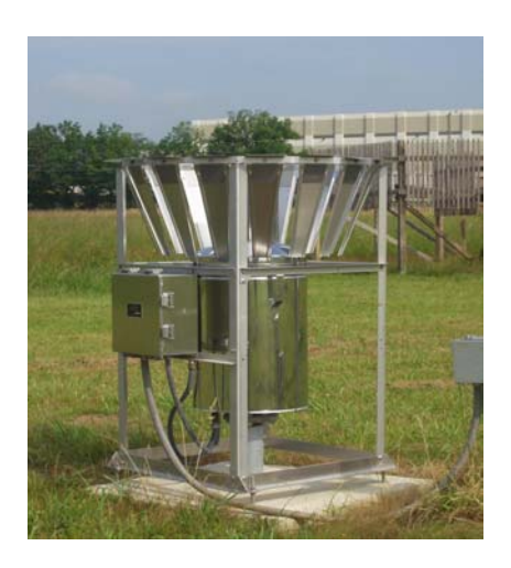
Figure 1 Production AWPAG

The production AWPAG with a Tretyakov shield (Production AWPAG) was the comparison sensor for this effort. It is a weighing gauge that collects precipitation as it falls through a 6.25 inch diameter orifice into a plastic storage container with a capacity of 56 inches of accumulation that includes antifreeze, which in some cases, can account for up to half of the liquid in the gauge. The storage container is continuously weighed and the weight is proportional to the catch amount. One AWPAG was installed with a Tretyakov shield at the test site as shown in Figure 1