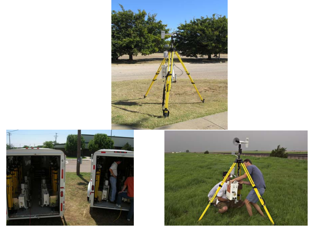
FIGURE 1 – Photographs of a StickNet station (top), transport trailers (lower left) and deployment (lower right) during the Spring 2007 field project.

Schroeder, J. L., and C. C. Weiss, 2008: Integrating research and education through measurement and analysis., Bull. Amer. Meteor. Soc. (accepted)