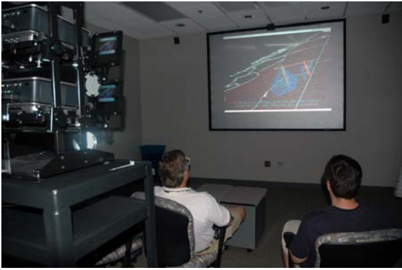
Figure 1. Picture of Visualization Laboratory using Geo Wall technology.

We continue to run comparisons between the WSR-88D and NWRT. In addition, we have started the analysis of the May 29, 2004 tornadic storm and other low-altitude circulations obtained with the NWRT (Heinselman, 2008). We are using our Visualization Lab to display the data in four-dimensions using Unidata's Integrated Data Viewer and Geowall technology (Figures 1 and 2).