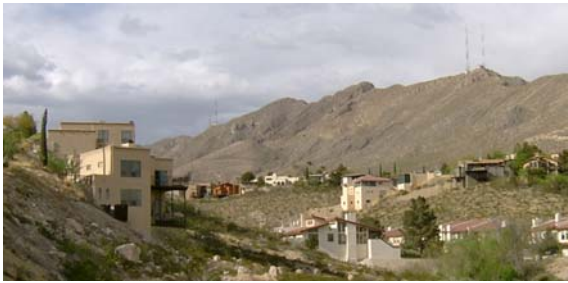
Figure 5. Neighborhood on the west slopes of the Franklin Mountains, El Paso.

colonias , lacking many aspects of infrastructure), were disproportionately impacted by the flood of 2006.