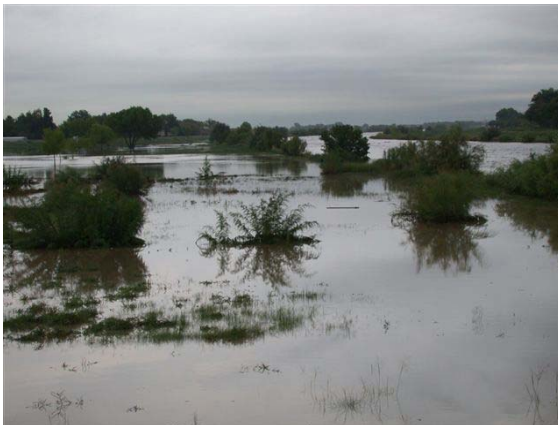
Figure 4. River flooding on the Rio Grande/ Rio Bravo del Norte just upstream of El Paso, August 2006

September 2006 led to river flooding in the Paso del Norte : the Rio Grande/ Rio Bravo del Norte flooded (Figure 4) five times during a five-week period (the first time since instrumental records started being kept that the river exceeded its banks in the Paso del Norte more than once in any single year), after not having flooded at all since 1958. Urban development in the floodplain has occurred in both cities in recent decades, putting the very low-lying areas (as well as the highlands) at a higher flood risk.