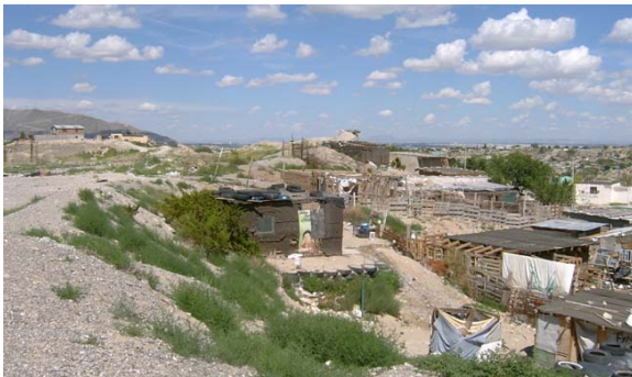
Figure 6. Neighborhood on the slopes of the Sierra de Juárez, Ciudad Juárez.