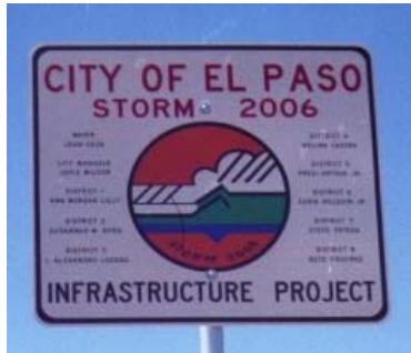
Figure 2. Street sign in El Paso documenting area of “Storm 2006” reconstruction.

the wettest three-month period in El Paso since records began being kept in 1878 and the first time in the period that El Paso has received >7.5 cm of rain in three consecutive months (Gill and Novlan, 2007). Flash flooding and river flooding occurred numerous times during the period.