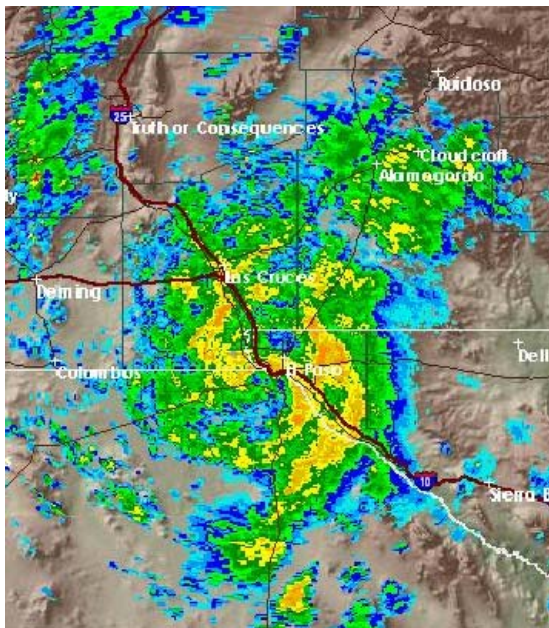
Figure 3. NEXRAD image of decaying tropical cyclone Dolly directly over the Paso del Norte, 8:21 AM local time July 26, 2008.

More recently, on the morning of 26 July, 2008, decaying tropical cyclone Dolly passed directly over the Paso del Norte (Figure 3), producing 4.8 cm of rain at El Paso International Airport, 11.2 cm on the El Paso West Side, and 11.8 cm at the Ciudad Juárez airport.