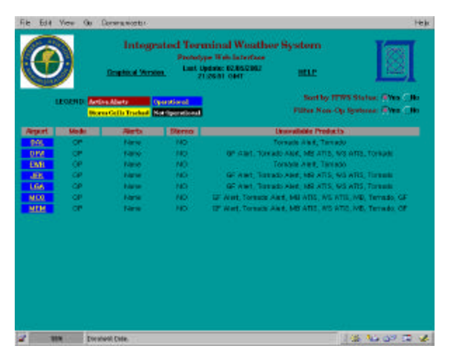
Figure 3. Text Interface.

The interface consists of toolbar on the left hand side, which is used for data interaction and window control, while the rest of the display is reserved for product display. The left hand toolbar consists of the window title showing the current airport and display, the current universal time (UTC), drop down menus for changing the airport and display product, two window control buttons which will apply the airport and display choice, and a group of six buttons for display customization. The data display area consists of an alert panel, on which ITWS alerts are displayed, a product display area where graphical or text products are shown, and a product status panel in which unavailable products are listed (if any).