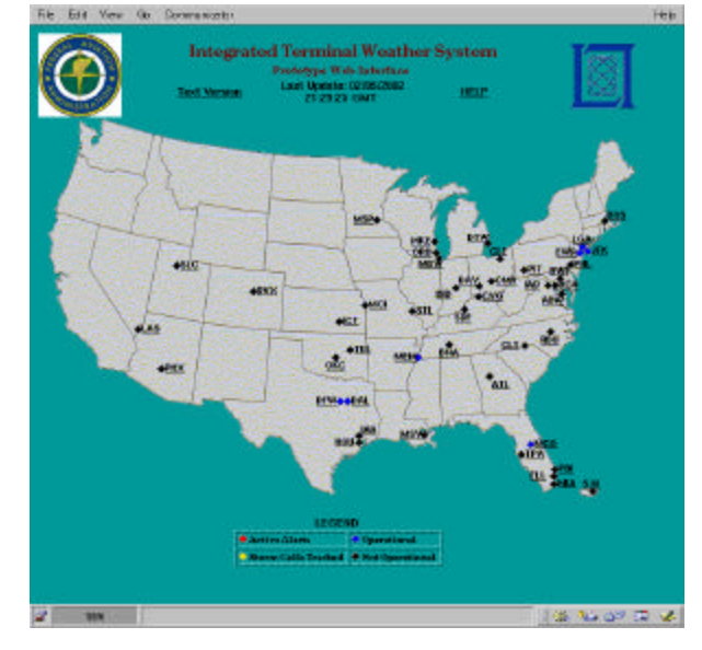
Figure 2. National Map Interface.

The national map interface (Figure 2) shows the ITWS airports superimposed on a map of the United States, with the color of the site icon indicating the status. The color codes are defined in Table 1. This interface depicts the spatial relationship among the ITWS sites, while at the same time showing the status of the individual ITWS airports.