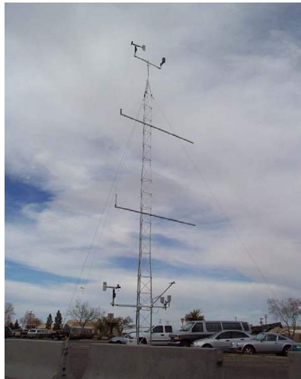
Figure 2. The eastern tower displays the cavity flow with westerly flow (10m AGL) over the top of the building and an easterly return flow at 2m AGL.