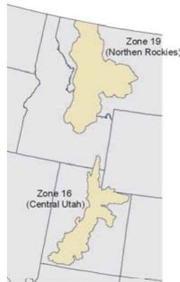
Figure 1 – LANDFIRE prototype mapping zones

The LANDFIRE prototype project, conceived in 1999 and funded in 2002, is being conducted by the USDA Forest Service, Rocky Mountain Research Station, Missoula Fire Sciences Laboratory (MFSL) and USGS EROS Data center in Sioux Falls, South Dakota (EDC) for two large areas in the western United States – Central Utah and the Northern Rocky Mountains – at 30-meter pixel resolution (Figure 1). The objectives of LANDFIRE are to develop a comprehensive suite of standardized, multi-scale spatial data layers and software needed to support the National Fire Plan, the Western States' 10-year comprehensive plan, and the President's Healthy Forest Initiative across the United States. The General accounting office describes LANDFIRE as "the only proposed research project so far that appears capable of producing consistent national inventory data for improving the prioritization of fuel projects and communities." (GAO 2002)