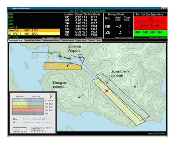
Fig. 1: The geographic display presents the most recent sensor data on a map background.

The geographic display (Figure 1) depicts the current sensor data (along with sensor locations) and JAWS alert area warnings on a background of local topography. Anemometer winds are indicated by green wind barbs and 1200 m profilers winds are indicated by blue wind barbs. Calm winds (< 3 kts) are indicated by a circle, rather than a barb and data interruptions or low-quality data are indicated by a small "X" at the sensor location. JAWS alert areas are indicated by polygons with fill colors and textures that correspond to the turbulence alert level. The alert box is clear when turbulence levels are predicted to be below the minimum alert threshold.