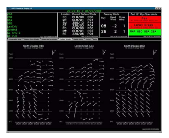
Fig. 3: Profiler winds display summarizes a onehour history of profiler winds.

Wind data is reported to an altitude that slightly exceeds 5000 feet and profiler wind barbs represent an average over the most recent tenminute interval.