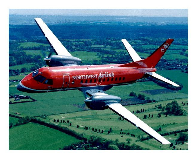
Figure 1. A Saab 340 aircraft operated by Mesaba Airlines.

We will receive these data at NOAA's Forecast Systems Laboratory (FSL), make them available to eligible users in a variety of ways (discussed below), compare them with data from other sources such as radiosondes and profilers, and ingest them into the publicly available Rapid Update Cycle (RUC) data assimilation and forecast system (Benjamin et al., 2004a).