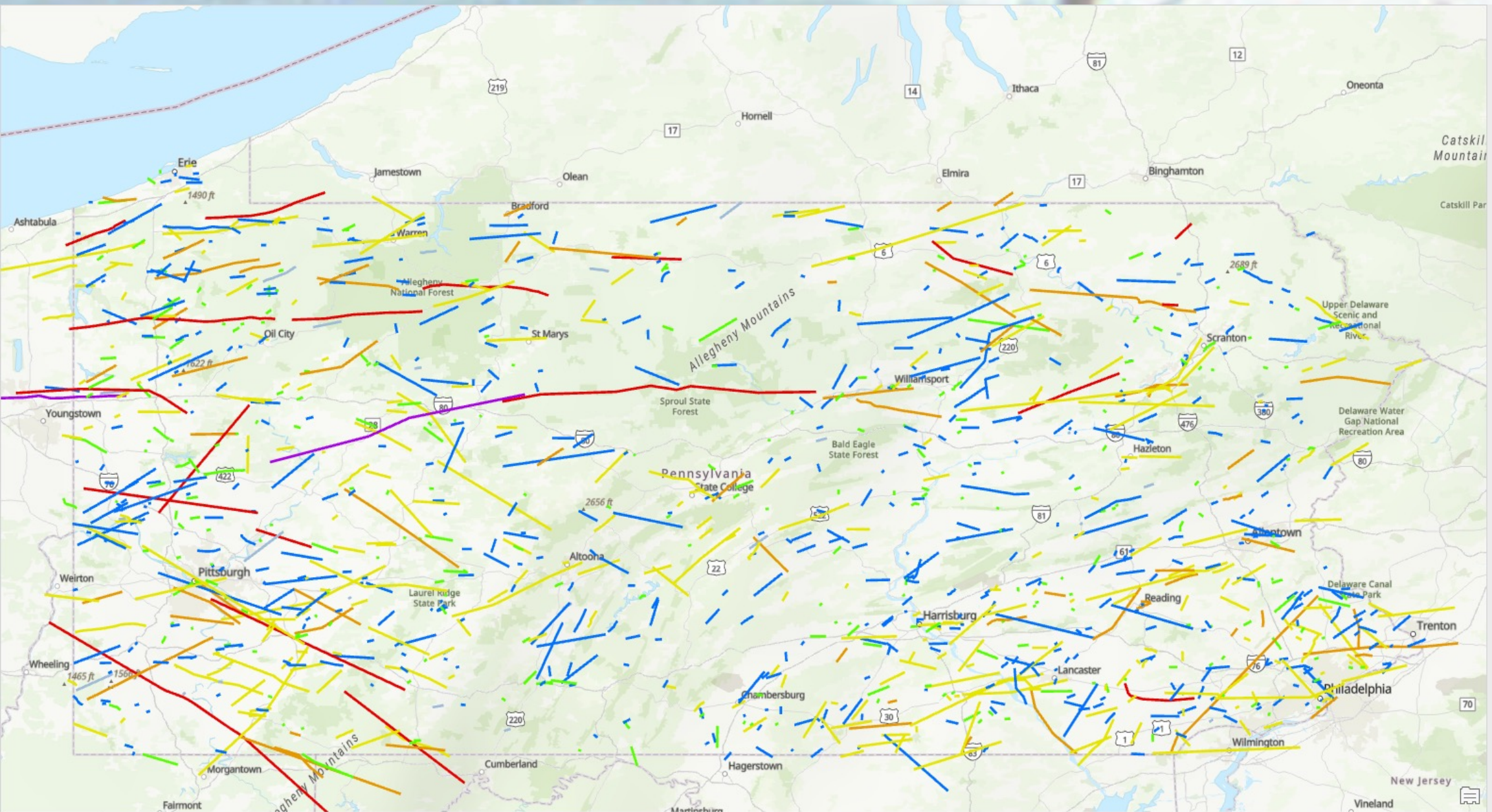
Figure 1: A map showing all known tornadoes in Pennsylvania from 1724-April 2023. Colors are based on rating. Green = EF-0, Blue = EF-1, Yellow = EF-2, Orange = EF-3, Red = EF-4, Purple = EF-5, Grey = EF-Unknown