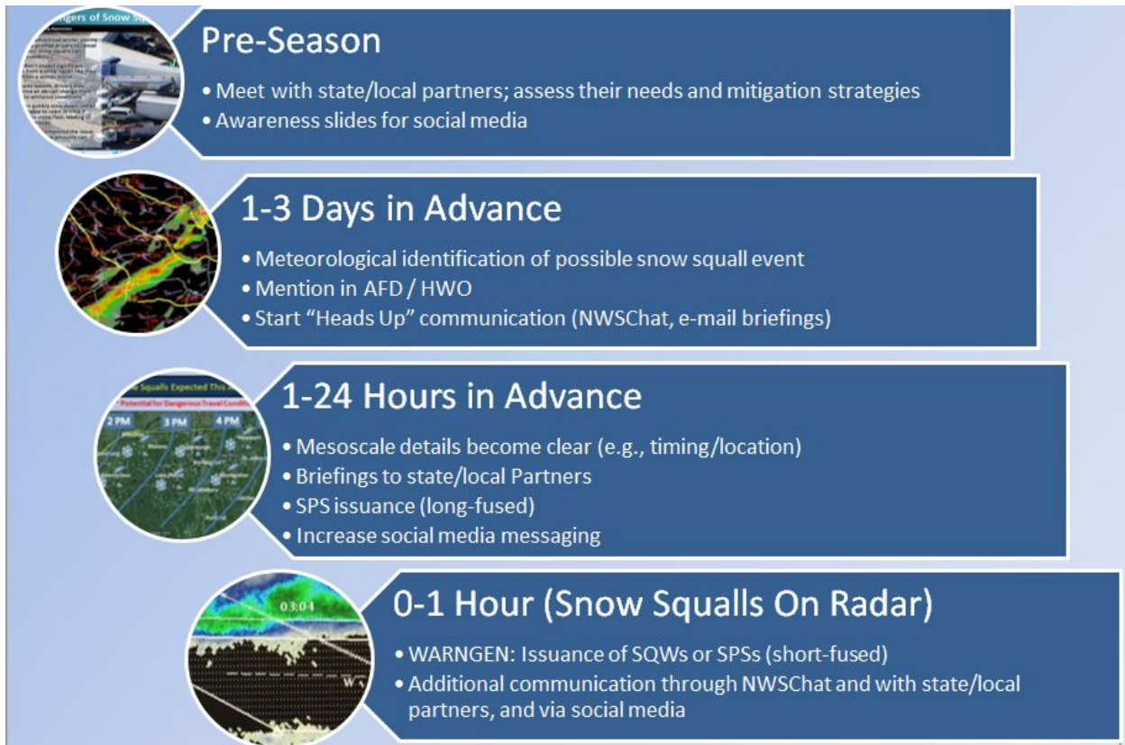
Figure 3. A summary (from NWS training slide) of potential NWS actions (“Ready-Set-Go” philosophy) at various time scales leading up to snow squall events and issuance of SQWs within 1 hour of occurrence. NWS text product acronyms include the Area Forecast Discussion (AFD), Hazardous Weather Outlook (HWO), and Special Weather Statement (SPS). NWSChat refers to instant messaging software used by NWS personnel to exchange critical warning decision expertise and other types of significant weather information essential to the NWS’s mission of saving lives and property with the emergency management and media communities.