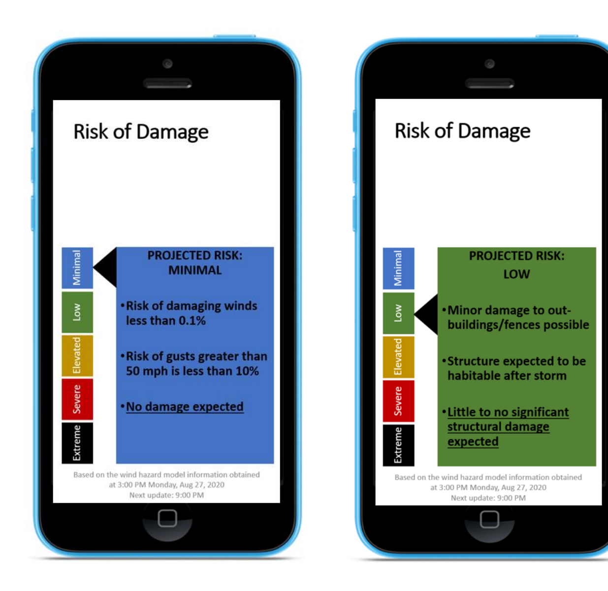
Figure 1 : Simulated views of the risk outputs on a mobile phone screen for the risk of damage for the following risk categories: a) minimal risk, b) low risk, c) elevated risk, d) severe risk, and e) extreme risk.