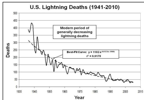
Figure-2. Annual lightning deaths in the U.S. from 1941-2010. Data are same as in Figure-1.

A running 21-year 5th and 95th percentile was calculated for each year from 1951 to 2000 centered on each year \pm 10 years. The analysis is limited to 1950 through 2000, to allow for the running \pm 10 running years to 1941 and 2010, respectively. A best-fit negative exponential curve was chosen for both the 5th and 95th percentile curves (Figure-3). Each of these best-fit curves are given by the following equations: