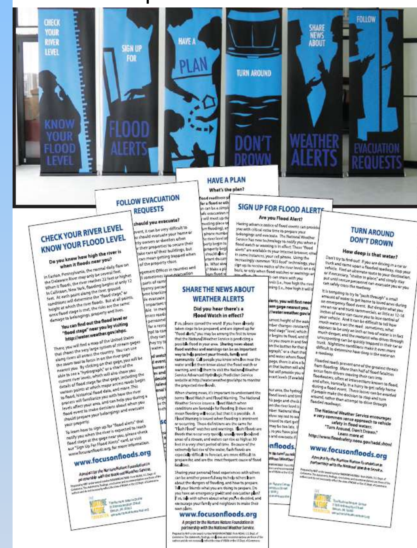
Exhibit booth and safety brochures are available to be loaned out for public events.

“Understanding Flood Risk” online interviews with experts in Geography, Climate, Hydrology, NWS flood alerts and Land Use as well as a Prepared Citizen.