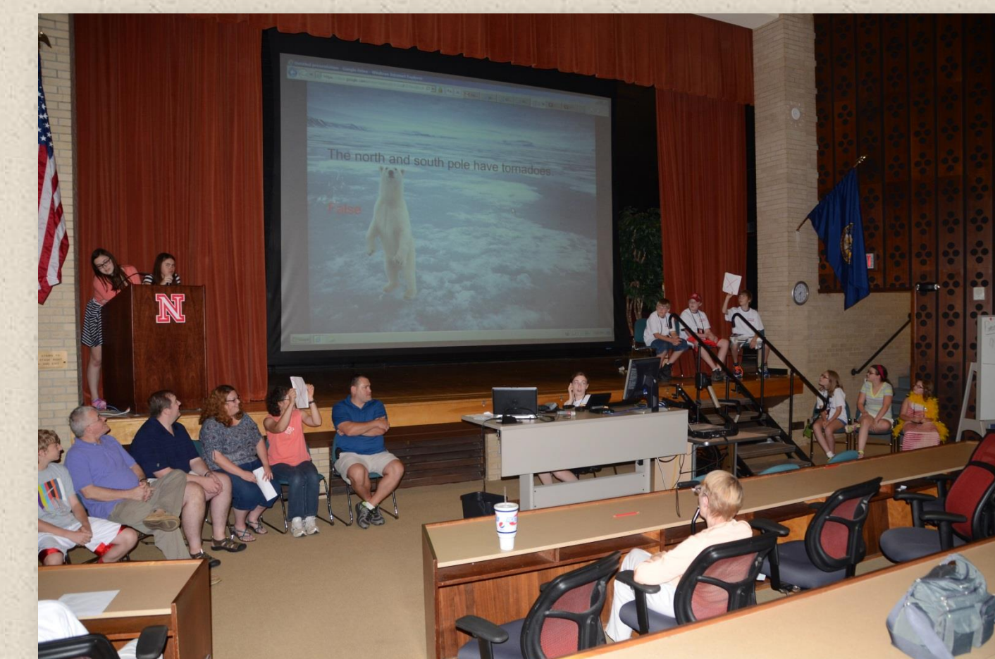
Playing “Are You Smarter than a Weather Camper?” with parents Friday evening