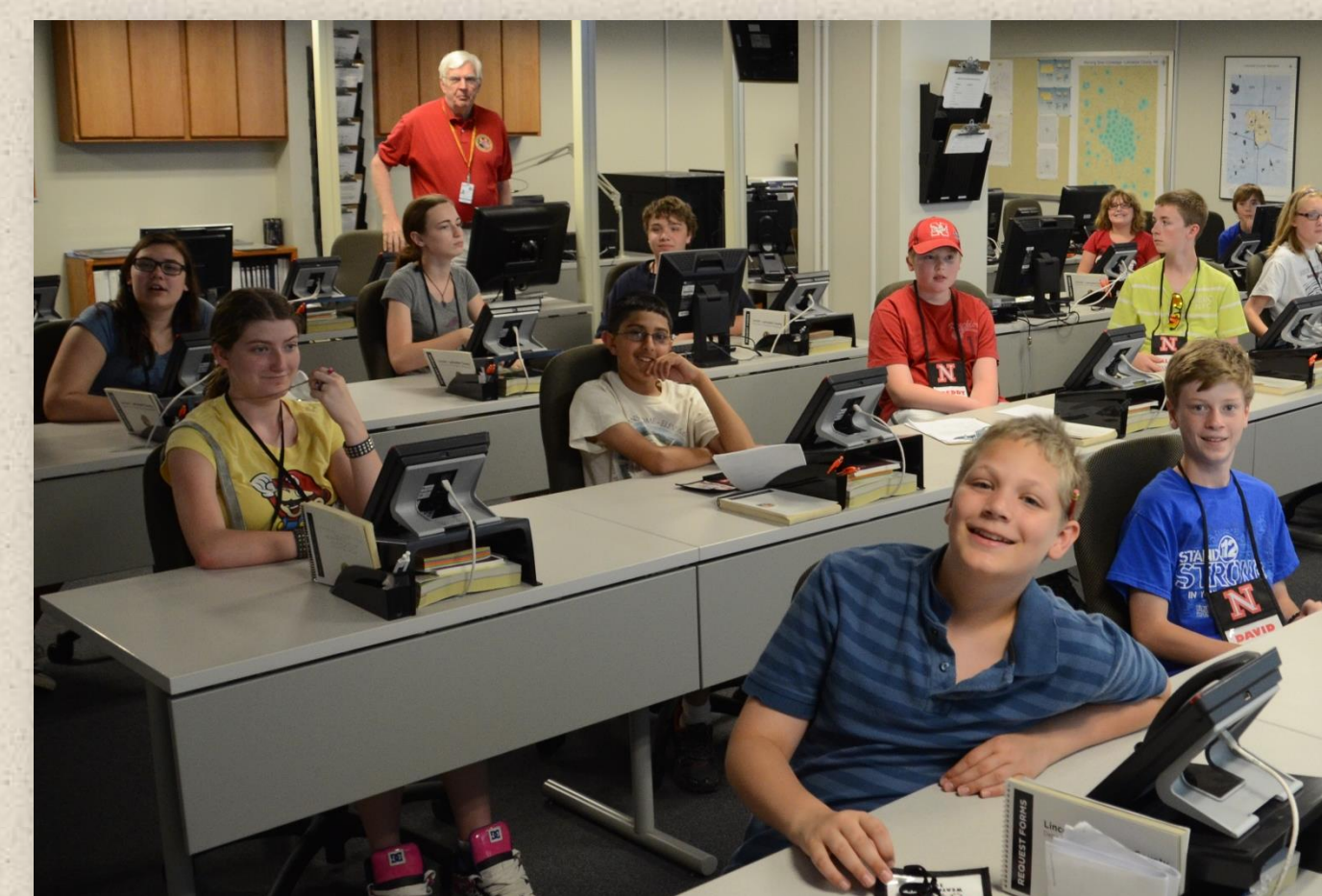
Emergency Management Office