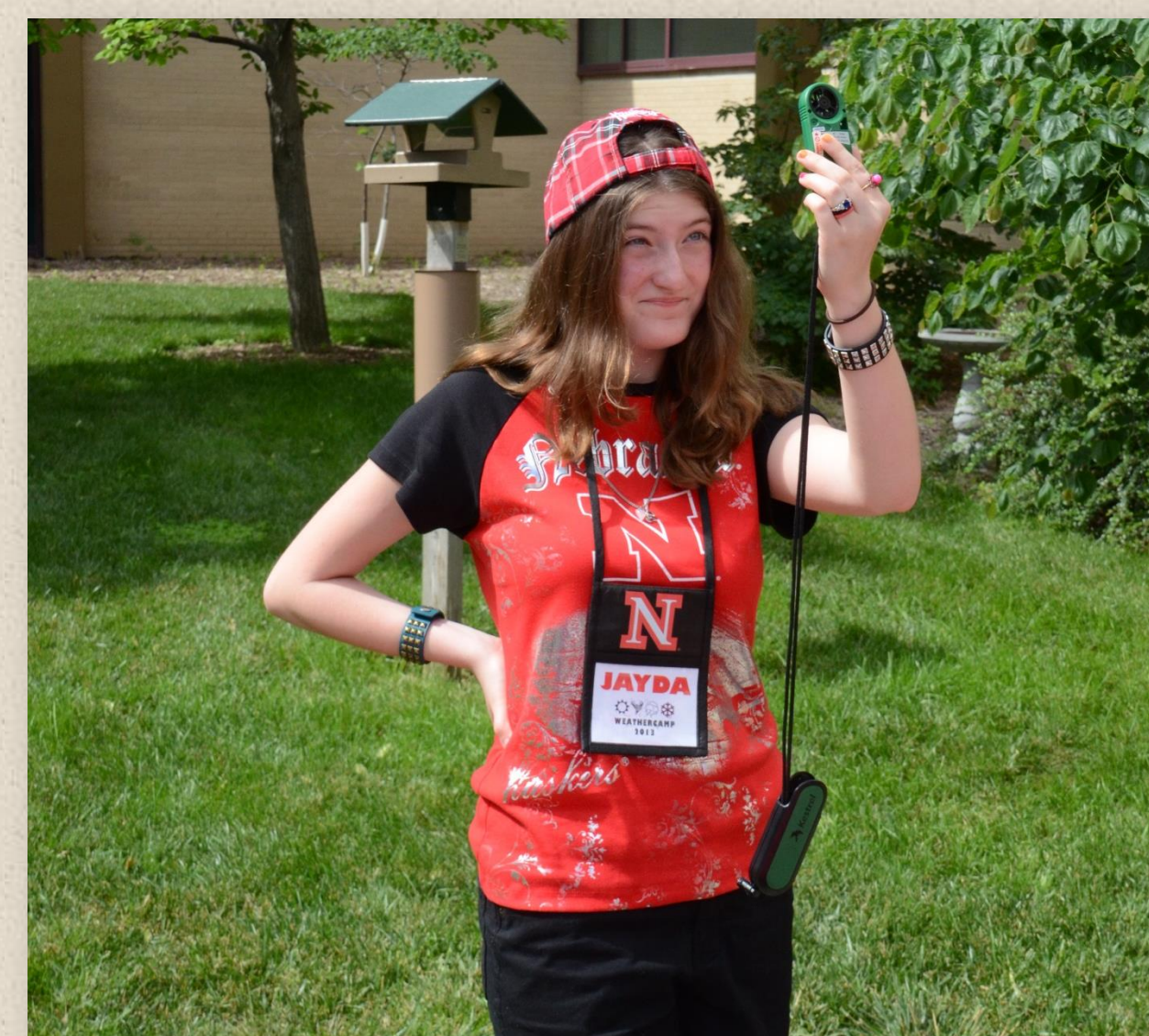
Exploring weather instruments

Learn group problem solving skills; develop leadership skills; learn how to take weather observations and forecast the weather; learn how to do research and create a research poster; and, learn about science careers through first-hand exposure to educational and career opportunities in atmospheric sciences.