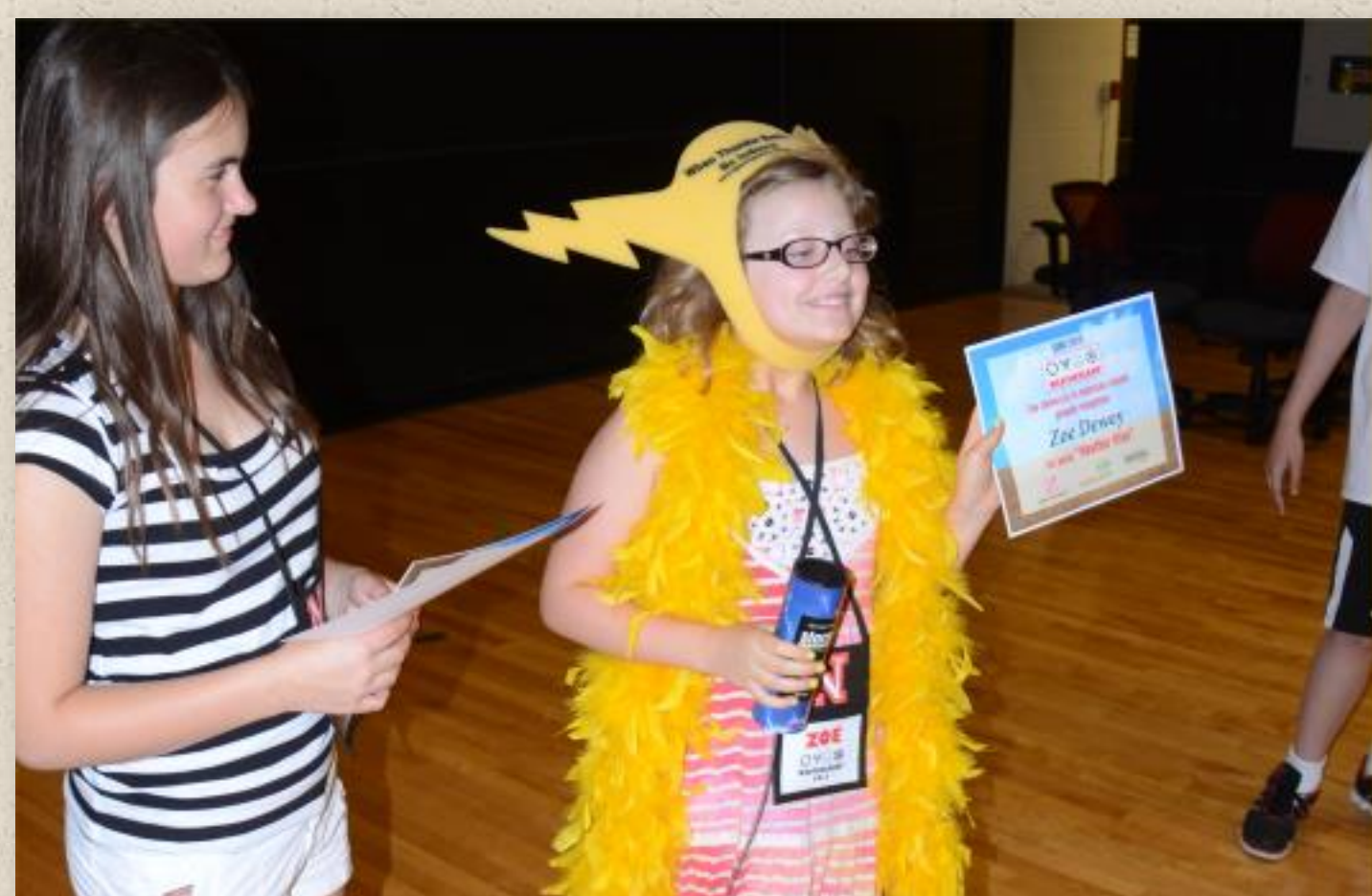
Graduation Friday evening