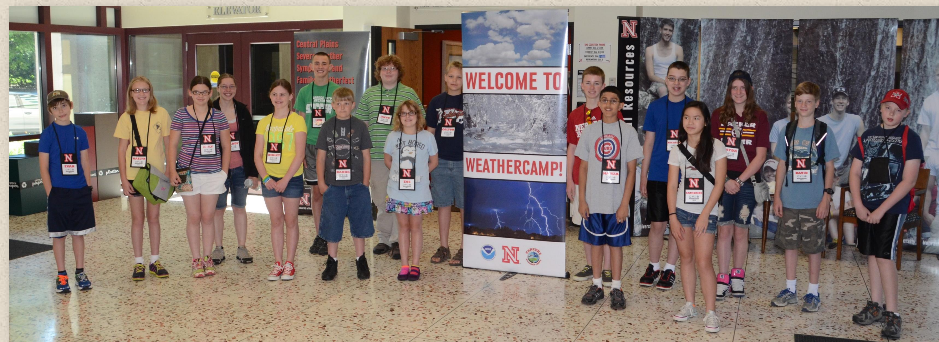
UNL Weather Camp participants, June 2013