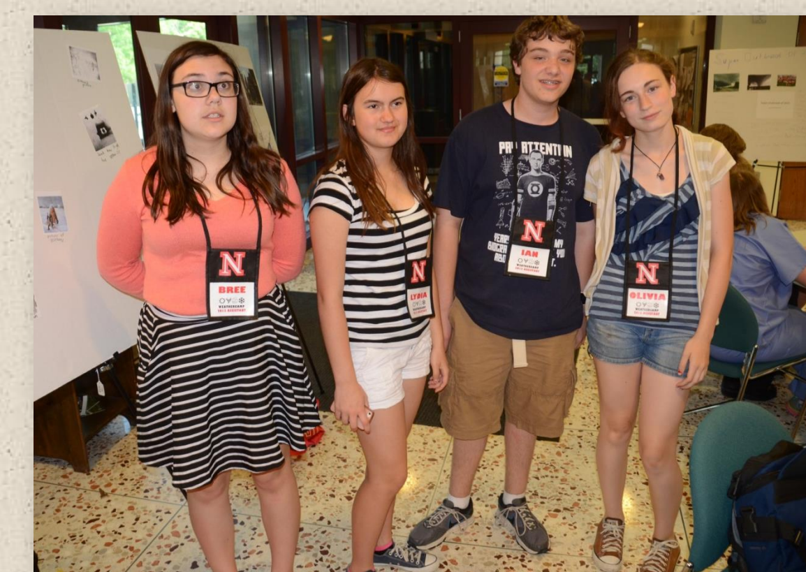
Camp counsellors are former UNL weather campers