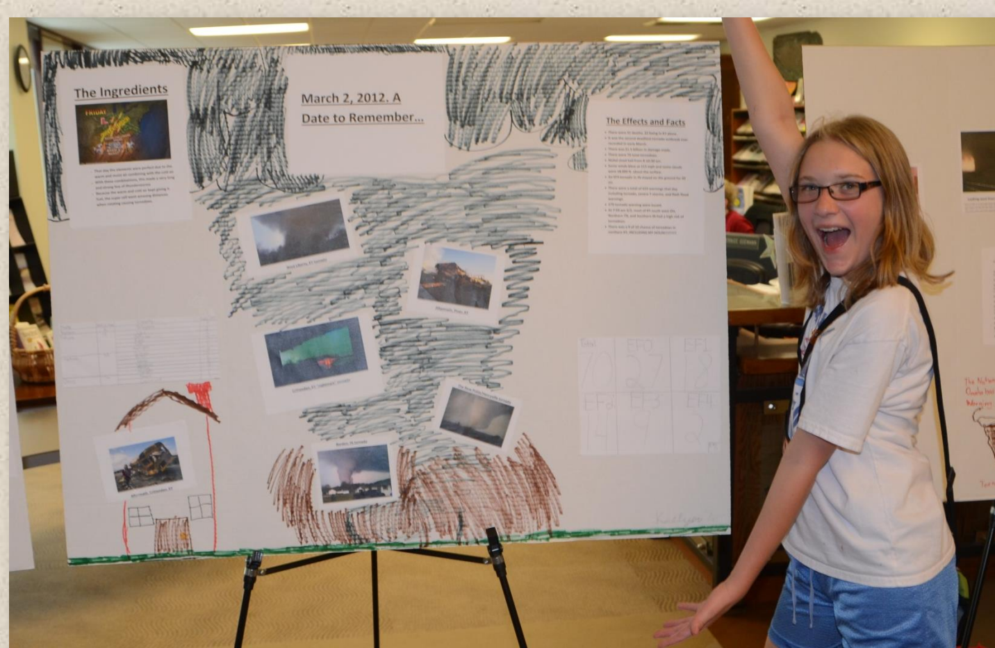
Research project on display