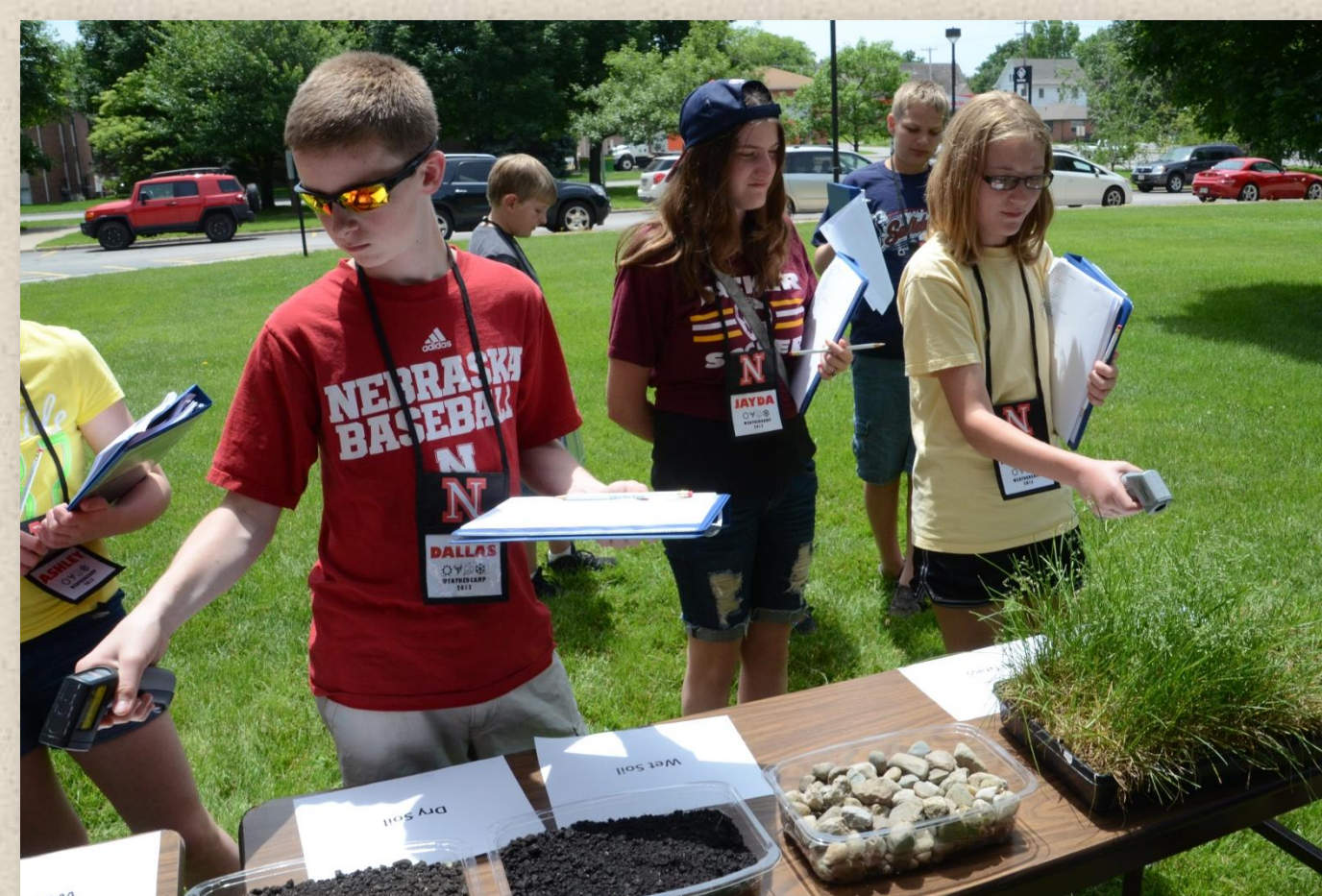
Conducting an outside experiment