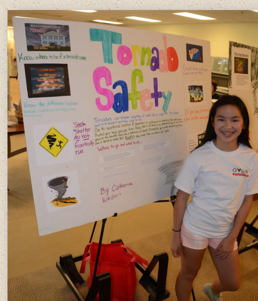
All campers did a research project