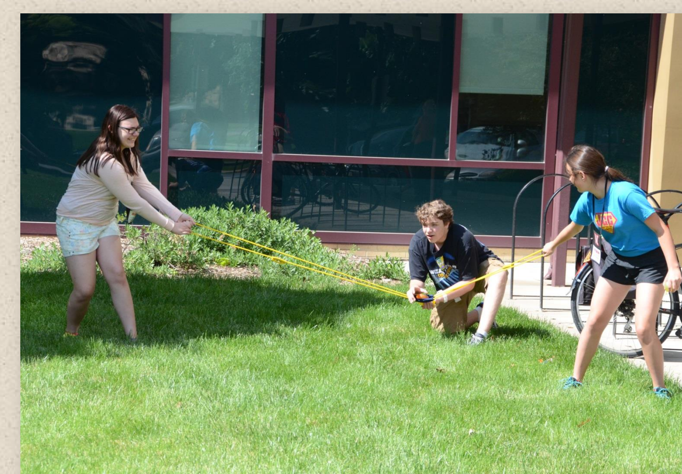
Physics of water balloon launching