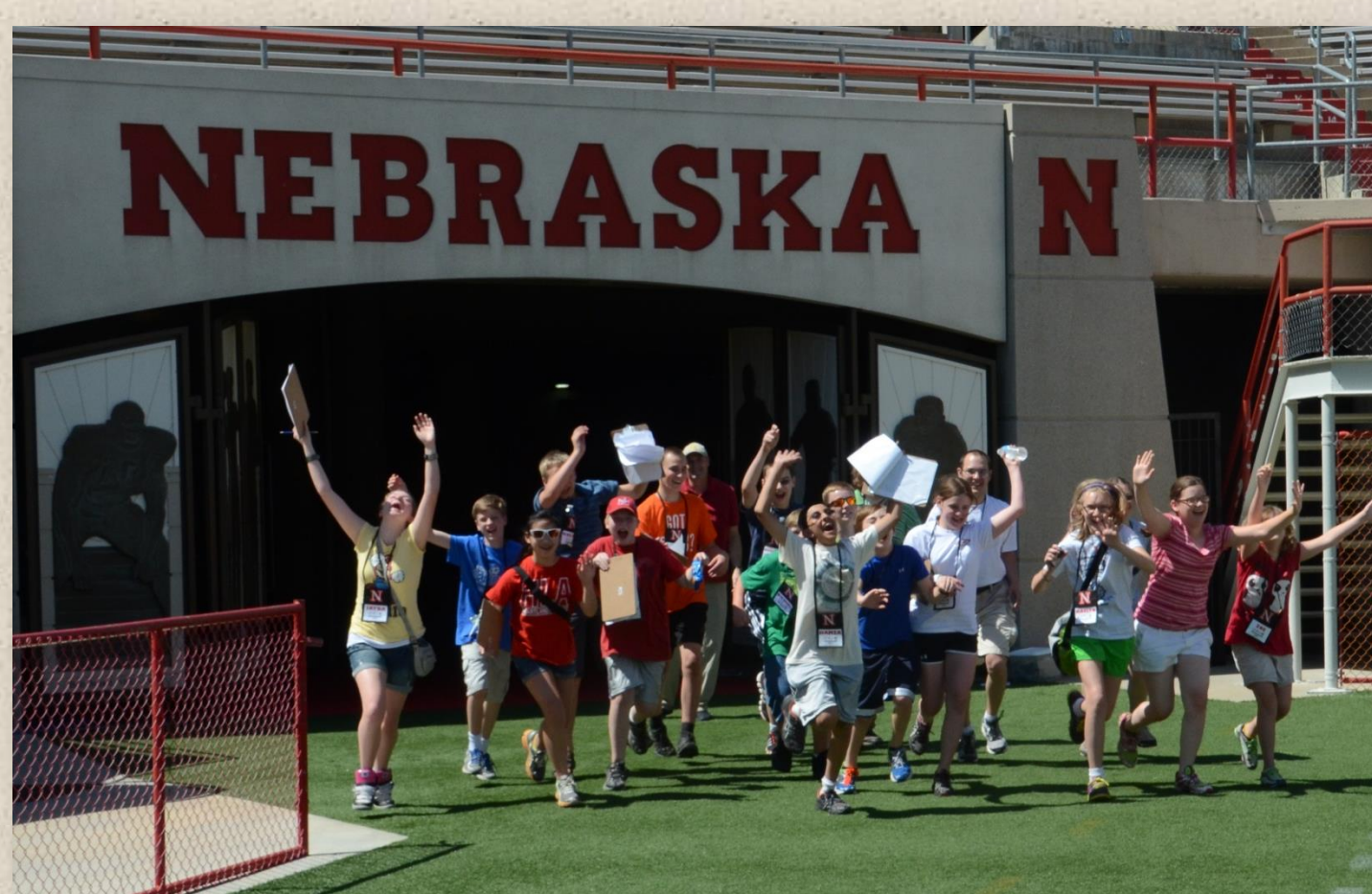
Micro-Climate of the football stadium