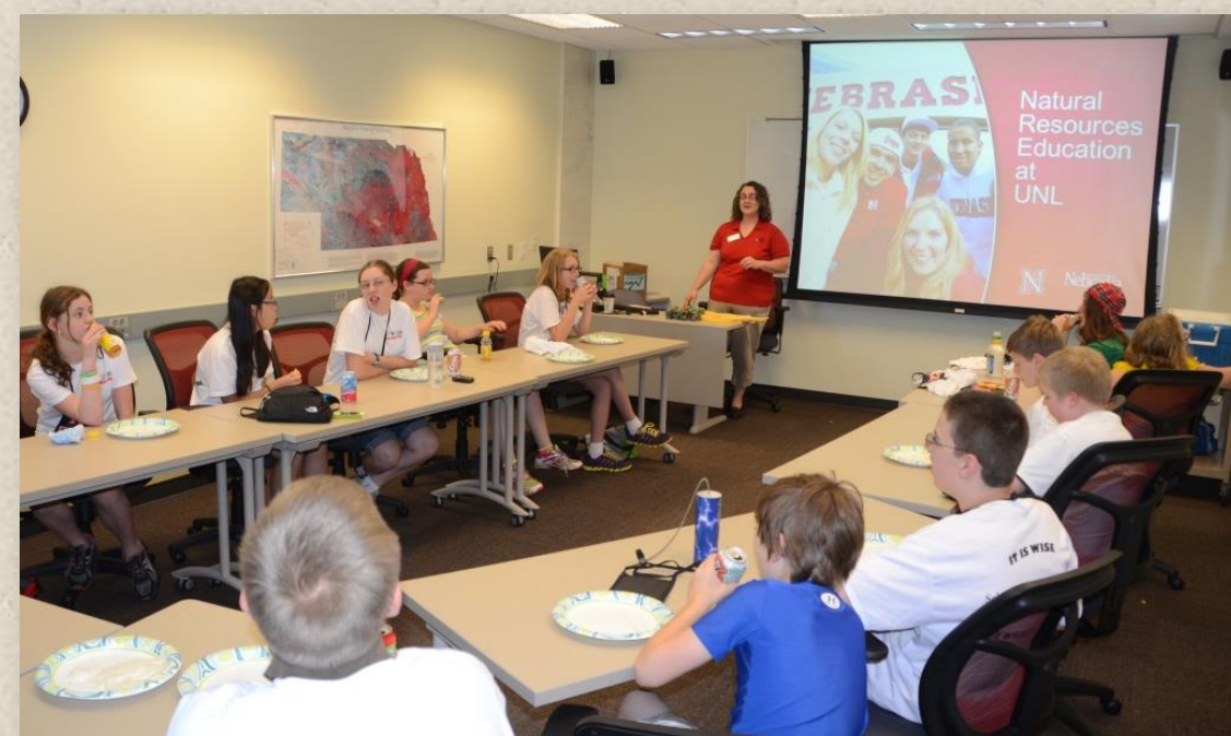
Learning about careers in science

Morning weather map discussion conducted by our staff Class room visits by local scientists (university and state and federal agencies) Class room hands-on experiments and demonstrations Guided Internet access to work on individual research projects Outside the building to use weather instruments