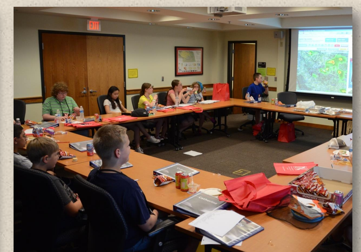
Classroom learning about weather