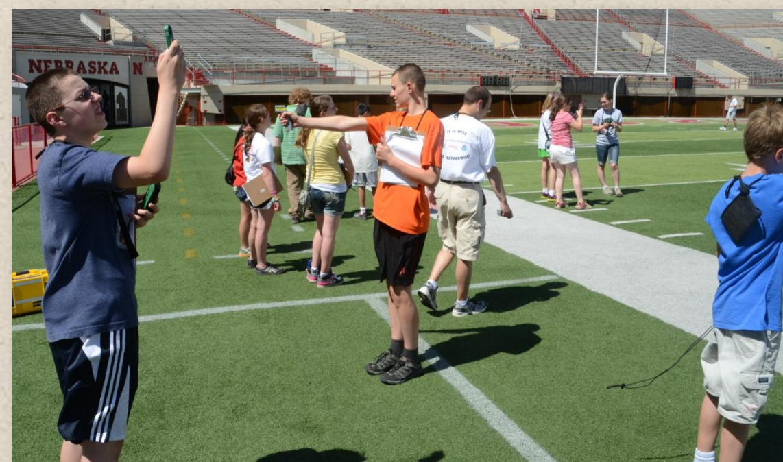
Micro-climatology exercise at the football stadium