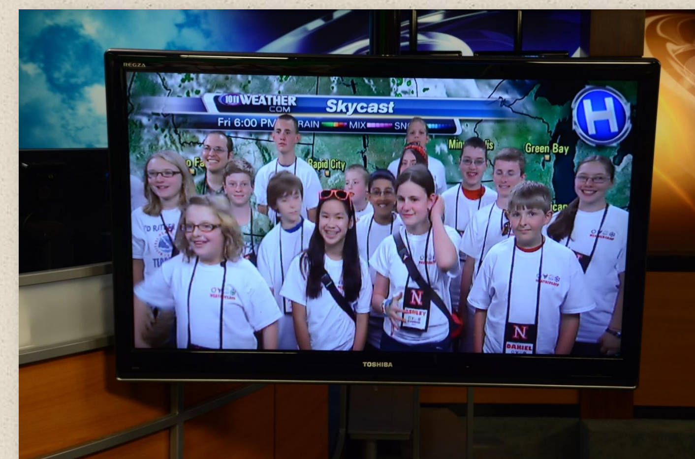
Weather campers on TV!