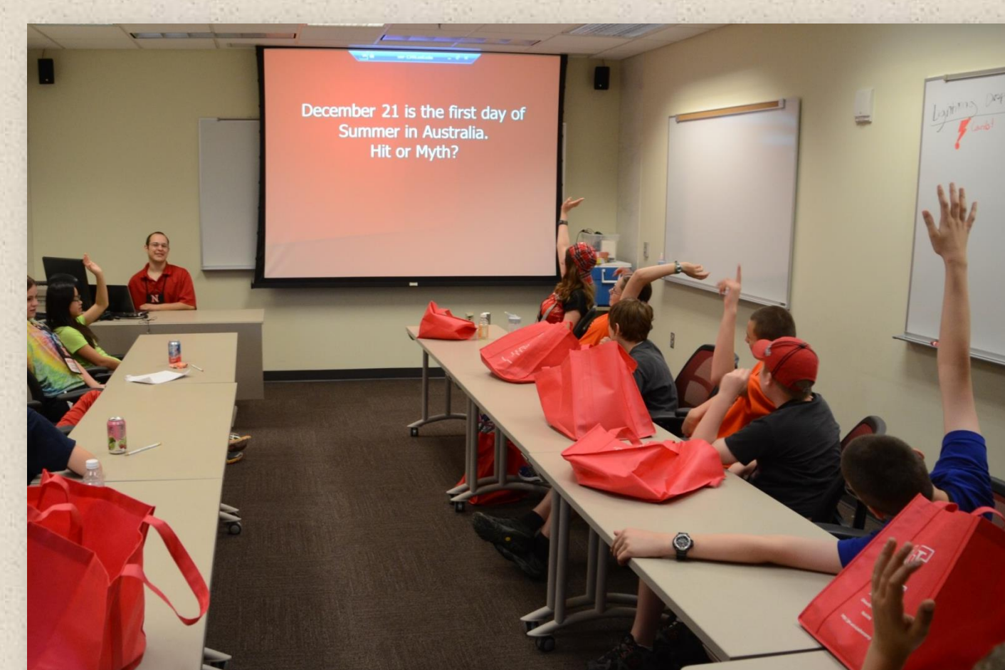
Playing weather “Hit or Myth”