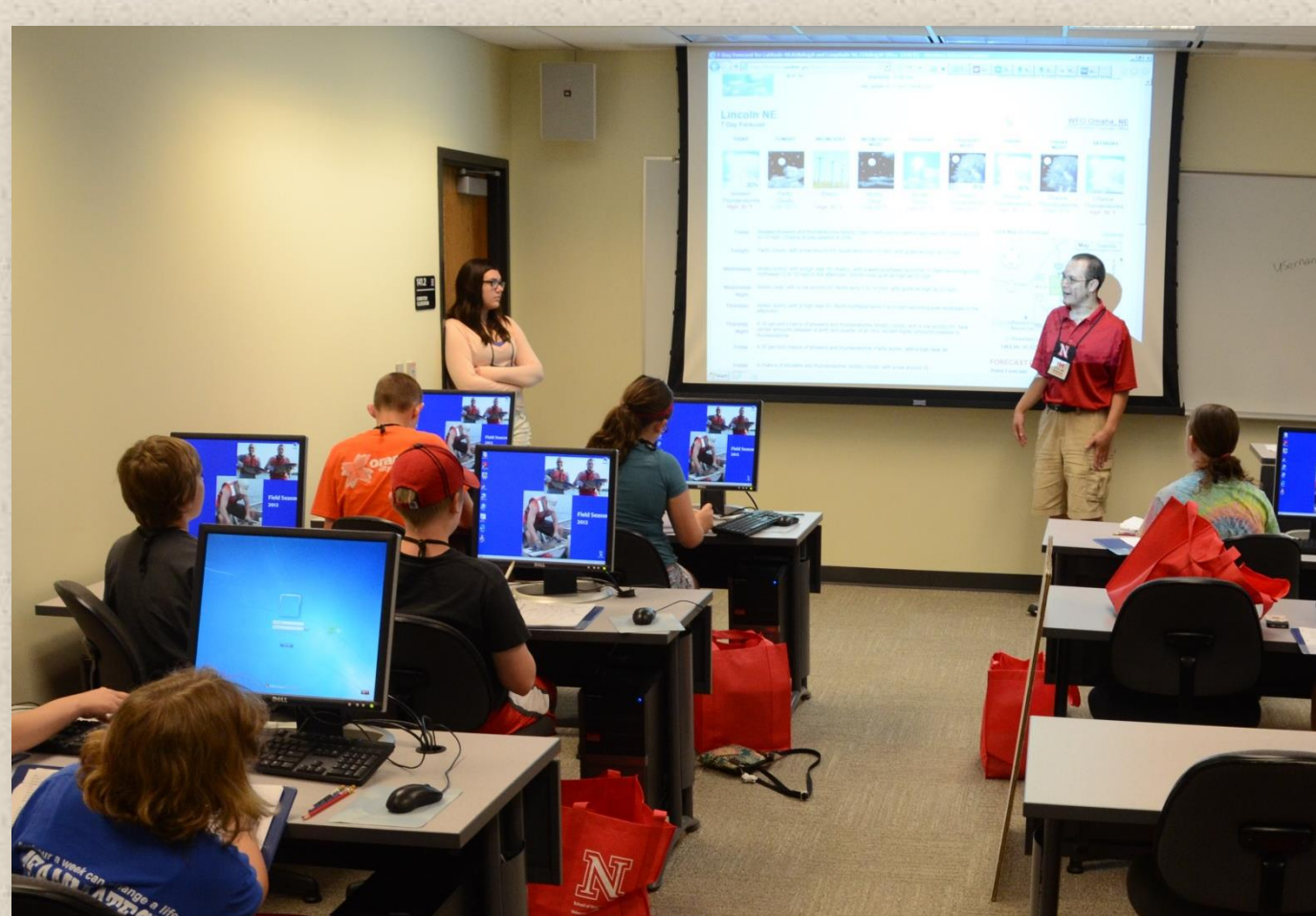
Daily weather briefings with camp staff