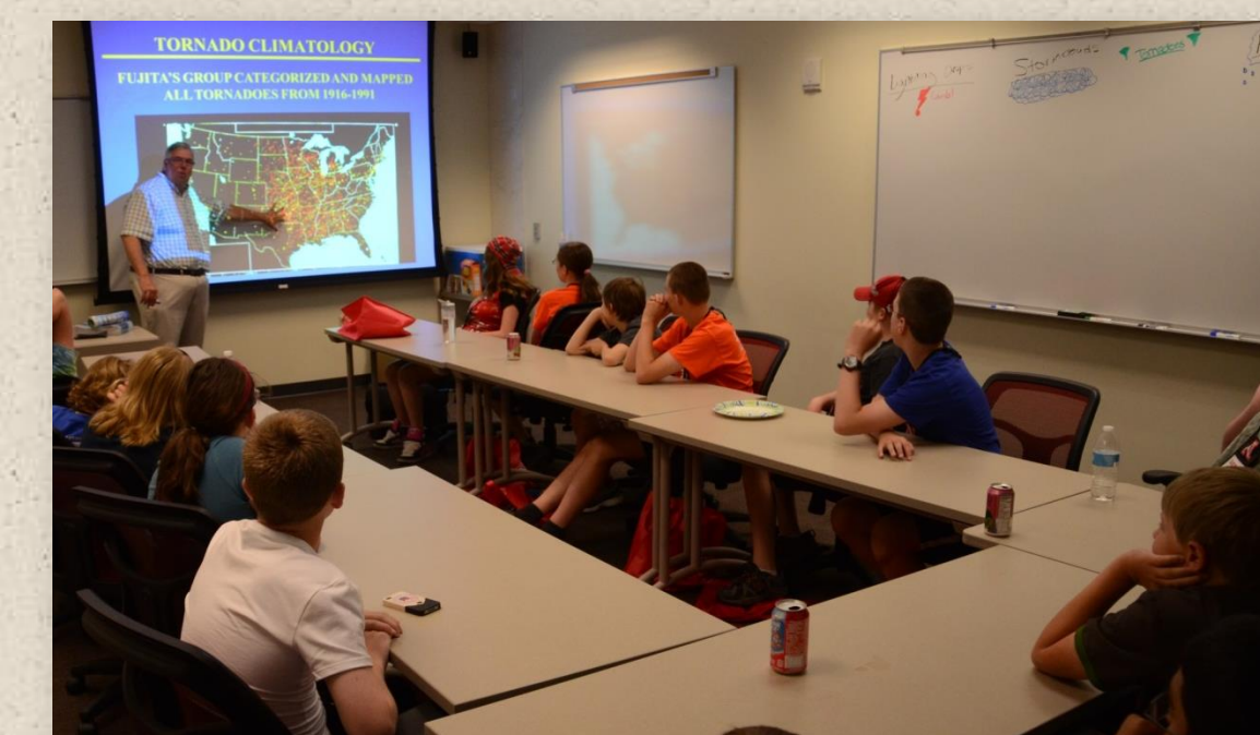
NWS Warning Coordination Meteorologist lecture