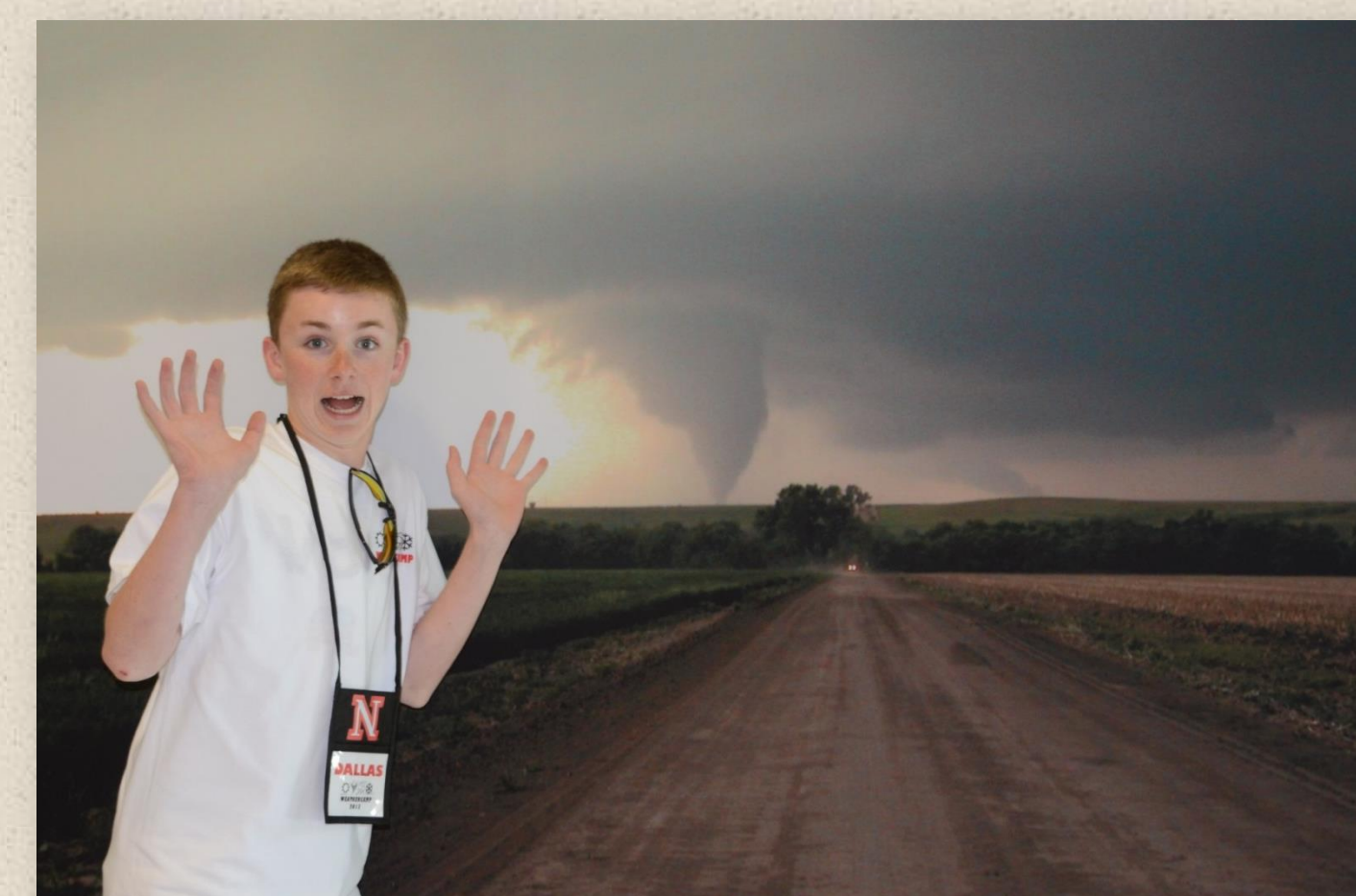
Tornado! In front of our tornado mural