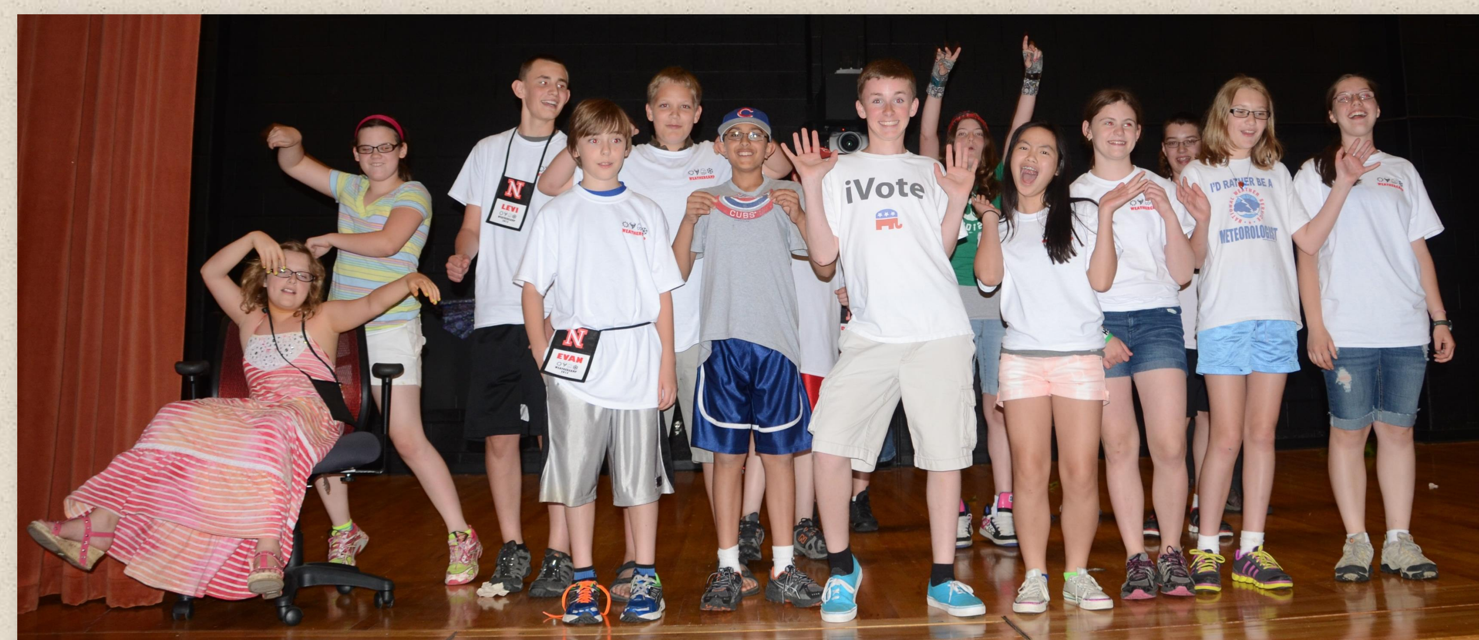
Campers on stage performing their “camp skits” for the parents after the cookout