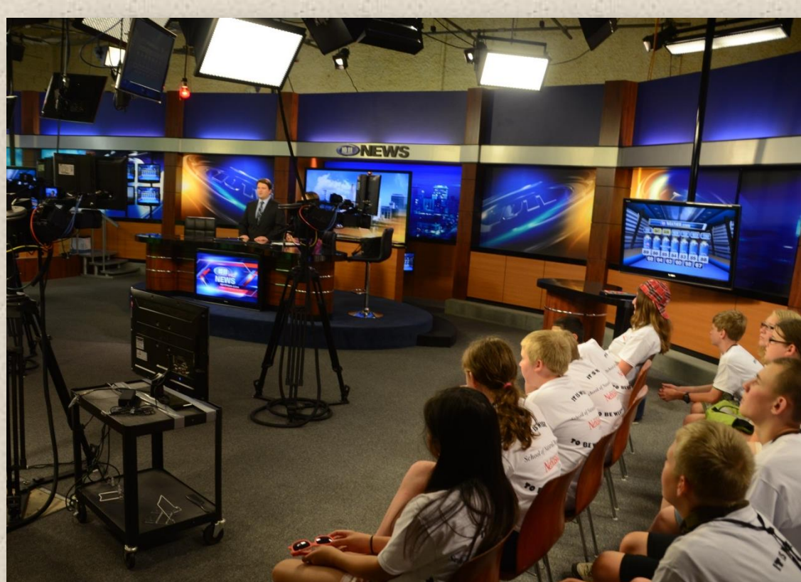
Watching live news and weather

"I never knew there were others like me out there." "Can we all come back next year, this was the most fun I want to do this again!" "When I was there I felt like I belonged." It is clear this helps the student reaffirm his/her choice of a career path.