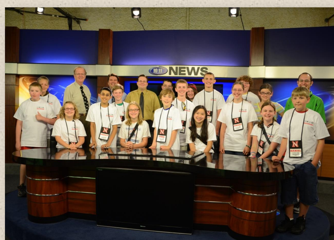
At the TV studio