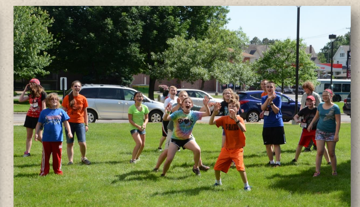
Daily outside play