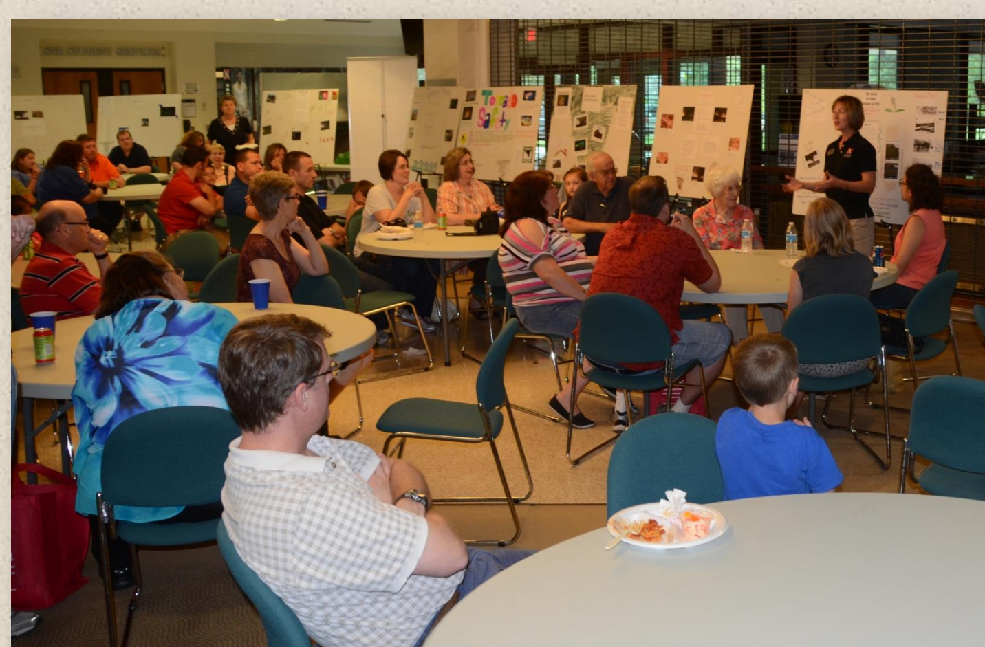
Camper dinner and award ceremony