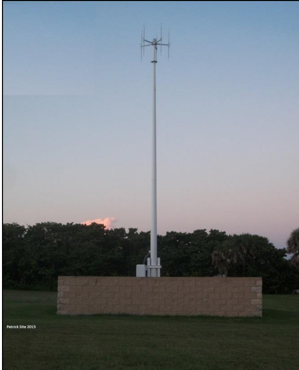
Figure 1. Picture of a TLS-200 sensor. This is the MERLIN North Patrick site on Patrick Air Force Base.