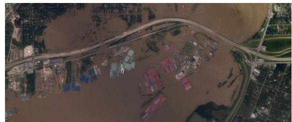
Near Lynchburg, Texas