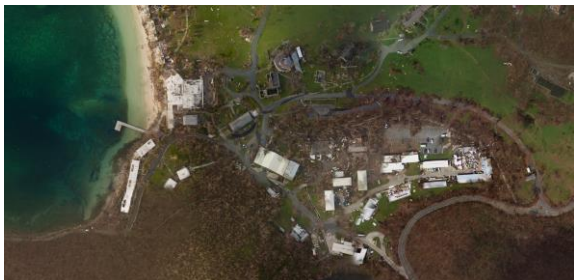
St. Thomas, U.S. Virgin Islands