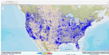
NWS Assets (before) and Mesonet (after)