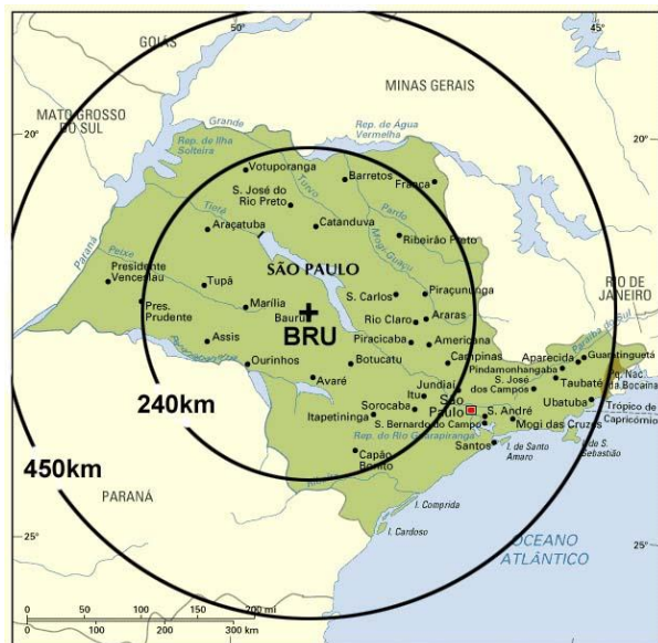
Figure 1. Map of the State of São Paulo, showing the main cities, rivers and the position of the Bauru radar (BRU) with 240 and 450 km

The data used in the study are from the Bauru S-band Doppler radar (Altitude 620 msl, Latitude 22°35' S and Longitude 49°03' W, Figure 1). This radar forms part of IPMet's (Instituto de Pesquisas Meteorológicas) network of two S-band Doppler radars, being operated continuously with volume scans every 7.5 – 15min, if rain occurs within the 240km range, comprising 11 PPIs between 0.3° and 34.9° elevation. The beam width is 2° and the resolution is 1km 2 in range and 1° in azimuth. The study period was from 1994 to 2004, with 27.072 CAPPs collected during January and 24.942 CAPPs during February.