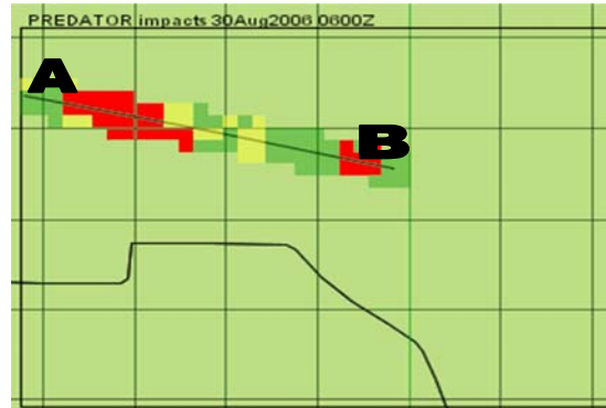
Figure 1. Enroute flight weather impacts for a modeled Predator unmanned aircraft flight from A to B across southern New Mexico, 0600 UTC, 30 August 2006. Green = favorable weather conditions, Yellow = marginal conditions, and Red = unfavorable conditions.

route over unfavorable (red) conditions between two points.