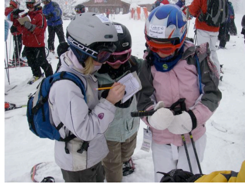
Figure 2: Students collecting and recording temperature, pressure, and humidity data

This place-based elementary school curriculum has been funded from local businesses (i.e. Ace Hardware, Smart Wool, and Steamboat Ski Corporation), local family foundations (The Mellam Family Foundation and the Brown Family Foundation), and a local organization (Rotary Club).