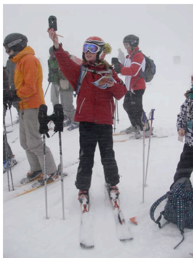
Figure 1: Student Measuring Wind Speed