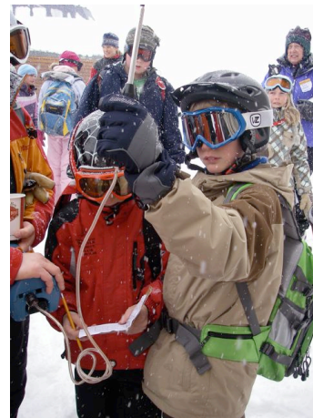
Figure 3: Students collecting and recording aerosol concentration data