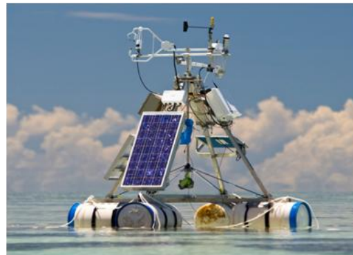
Figure 2. Pontoon mounted Eddy Covariance unit at Heron Reef

The EC unit consisted of a Campbell Scientific CSAT-3 sonic anemometer, Li-Cor CS7500 open path H 2 O and CO 2 analyser, a Kipp and Zonen CNR1 net radiometer, while a Vaisala HMP45A sensor recorded ambient air temperature and humidity. All instruments were fixed at a constant height of 2.2 m above the surface, were connected to a CR23X data logger with measurements made at 10 Hz and block averages logged every 15 minutes. Water level was recorded using HOBO U20-001-01 water level monitors and near-surface water temperature at a depth of 0.05 m below the surface was monitored using a HOBO water temperature PROV2 logger.