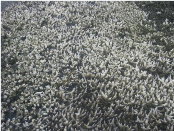
Figure 4. Bleached colony of Acropora aspera on Heron Reef, 23 February 2009.

believed to have been associated with coupling of the weak north to north-westerly geostrophic flow with the surface, which decoupled from the surface in the early morning. Daily peaks in water surface and near-bottom temperatures lagged maximum Q_{Swr} by 4-5 hours as heating of the water column continued throughout the afternoon, until Q_{Swr} fell below 0 \text{ W m}^{-2} at approximately 1700 EST. This indicates that there was limited heat loss from the site due to horizontal advection within the water column.