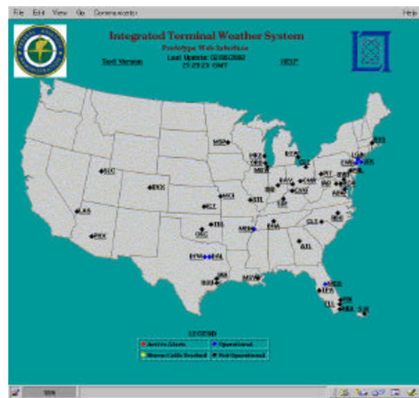
Figure 2. National Map Interface.

The national map interface (Figure 2) shows the ITWS airports superimposed on a map of the United States, with the color of the site icon indicating the status. The color codes are defined in Table 1. This interface depicts the spatial relationship among the ITWS sites, while at the same time showing the status of the individual ITWS airports.