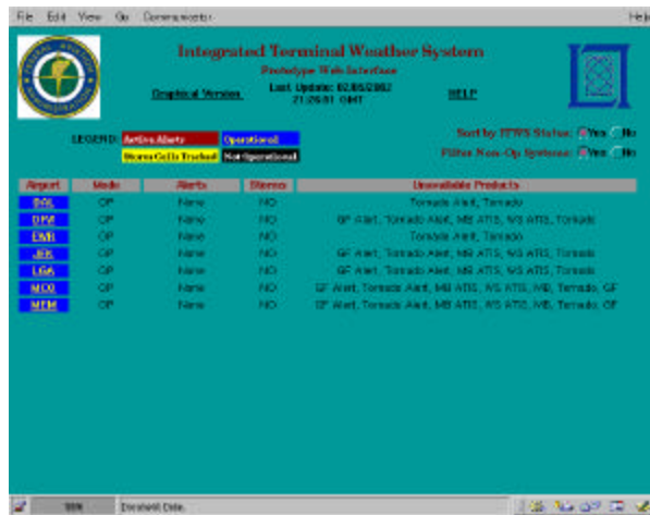
Figure 3. Text Interface.

The interface consists of toolbar on the left hand side, which is used for data interaction and window control, while the rest of the display is reserved for product display. The left hand toolbar consists of the window title showing the current airport and display, the current universal time (UTC), drop down menus for changing the airport and display product, two window control buttons which will apply the airport and display choice, and a group of six buttons for display customization. The data display area consists of an alert panel, on which ITWS alerts are displayed, a product display area where graphical or text products are shown, and a product status panel in which unavailable products are listed (if any).