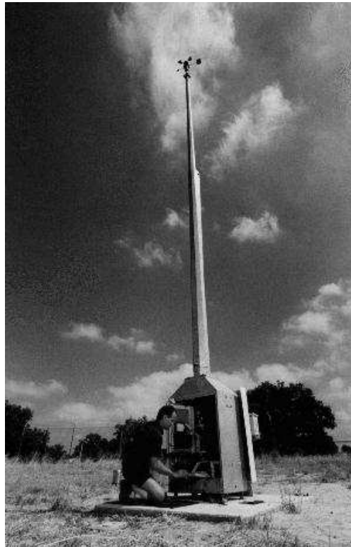
Figure 1: A typical automatic weather station.

be much larger. The Australian domestic passenger fleet is under 1000 aircraft but provides over 500,000 domestic (plus 100,000 international) passenger flights (aircraft movements) per annum, whereas the general aviation fleet is over 10,000 aircraft flying for around 2,000,000 hours per annum (Civil Aviation Safety Authority 2002).