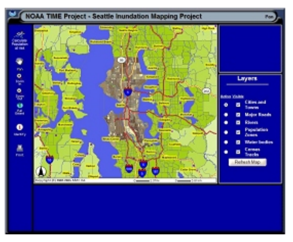
Fig. 2 Tsunami Map Server

The functioning of the Web Map Calculator back end is invisible to the user. The user is presented with a web page with introductory text and a view of downtown Seattle. Census tract data are colored by population during the day or night and elevation information for the area is shown. An HTML form is displayed giving the user the option to generate a new shapefile that shows the area and population affected by a wave height of a specified height at a specified time of day. The request is sent to the JAVA backend calculator for geoprocessing on-the-fly. The resulting shapefile is either presented the user in a new map service or delivered to the user for use another application.