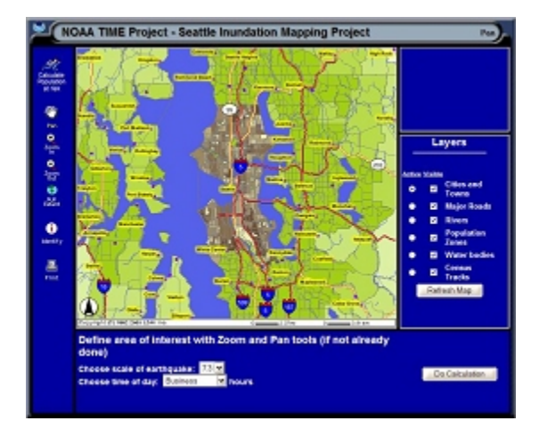
Fig. 3 Web Map Calculator front end

The functioning of the Web Map Calculator back end is invisible to the user. The user is presented with a web page with introductory text and a view of downtown Seattle. Census tract data are colored by population during the day or night and elevation information for the area is shown. An HTML form is displayed giving the user the option to generate a new shapefile that shows the area and population affected by a wave height of a specified height at a specified time of day. The request is sent to the JAVA backend calculator for geoprocessing on-the-fly. The resulting shapefile is either presented the user in a new map service or delivered to the user for use another application.