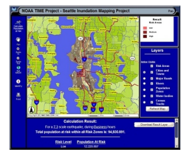
Fig. 4 Census tracts affected by an inundation event