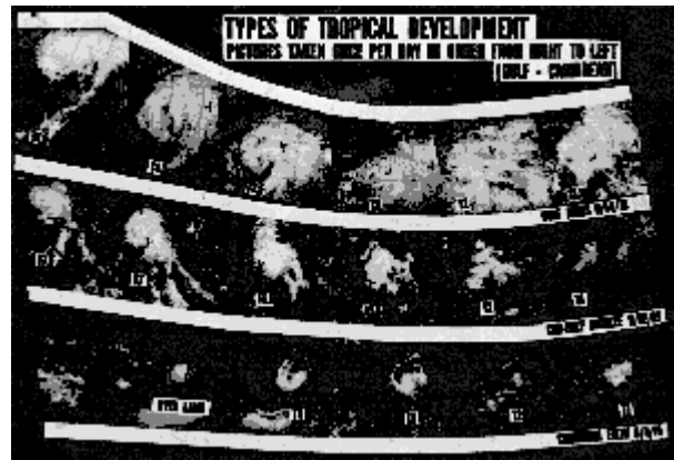
Figure 1. Examples of characteristic cloud patterns of developing TCs. From Dvorak (1973).

The heart of the Dvorak technique is the relationship between satellite-observed cloud patterns and TC intensity. The original technique highlighted the evolution of the cloud patterns associated with stages of TC development in visible imagery (Fig. 1). Most emphasis was placed on size measurements of the central dense overcast (CDO) and eye patterns usually associated with stronger systems. Cloud patterns of weaker systems were treated more subjectively. The Dvorak (1975) revision made few changes, although there was some refinement of measurements for weaker systems.