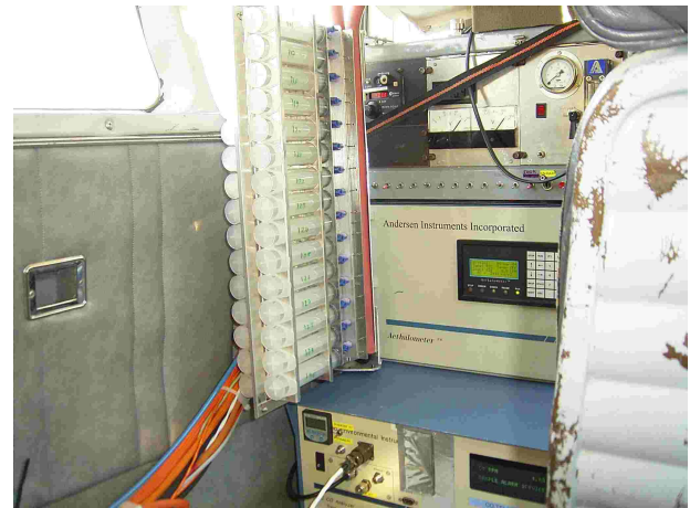
Figure 7 Airborne instrumentation for SF 6 measurements

the plume, and also with the Piper Aztec aircraft, at 100m and 200m above ground level.