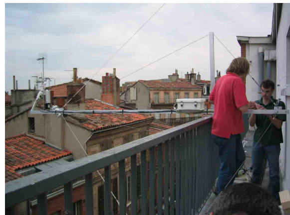
Figure 3 Boom above street to measure canyon top processes

Turbulent fluxes of sensible and latent heat, carbon dioxide and particulate matter are also measured near the top of two street canyons. The data will provide insight into the vertical exchange processes operating between the urban canopy layer and urban boundary layer.