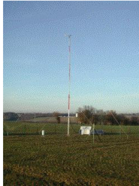
Figure 5 a rural station

Two rural flux stations were installed 30 km from the city with the same instrumentation as the central mast. They will serve as reference sites to allow comparison with the urban SEB. In addition, 4 rural sites are located 10 km from the city to complete the description of the UHI, and 50 other stations are present in a radius of 100 km.