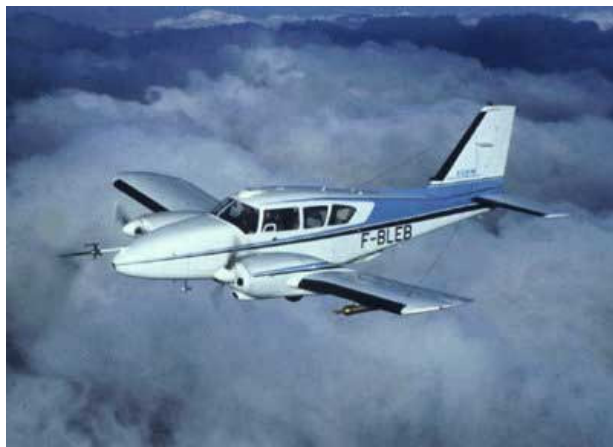
Figure 6 The Piper-Aztec instrumented aircraft

Instrumentation is composed of classical meteorological parameters, fast wind sensors and aerosol observations: a particle counter and an aethalometer, which measures the radiative absorption of aerosols, indicating the concentration of black carbon.