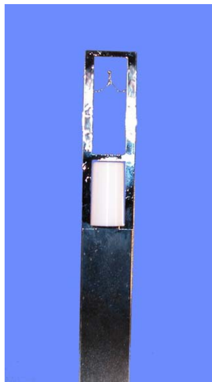
Figure 2: Temperature-Humidity Boom

The humidity sensor is a variable capacitance device. It has a polymer dielectric insulator with a permittivity that varies with relative humidity. Due to its small size it has a fast response time (2 seconds at sea level and 20 deg C). There is very little performance degradation after long-term saturation with nearly instantaneous de-saturation. There is no performance degradation after immersion and thawing.