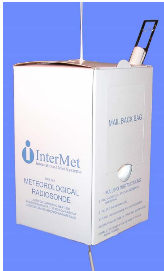
Figure 1: InterMet iMet 1 Radiosonde

user to bend the boom out to a 45 degree angle and feed the elastic string with a ring through the top of the wrapper for attachment to the balloon string. A Styrofoam door inside of the wrapper is raised to access two switches, via a hole in the wrapper, that are used to turn the power on and to set the transmitter to one of 8 frequencies in the 400.15-406 MHz range. There is no need to insert a battery pack, connect the battery pack or fill a battery with water. The mail back bag is accessible from the open flap so the user can write the launch data on the bag. A flap is provided to access the mail back bag for someone who may find the radiosonde after a flight.