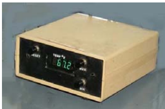
Figure 1. NWS Maximum-Minimum Temperature System (MMTS) radiation shield and display unit.

At the time, many climatologists expressed concern about this mass observing change. Growing concern over potential anthropogenic climate change was stimulating countless studies of long-term temperature trends. Historic data were already compromised by station moves, urbanization, and changes in observation time. The last thing climatologists wanted was another potential source for data discontinuities. The practical reasons outweighed the scientific concerns, however, and MMTS deployment began in 1984. No published results of pre-deployment data comparisons were offered at the time, although some internal NWS documents describing field test results were circulated.