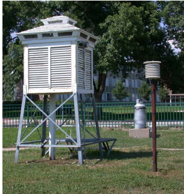
Figure 2. MMTS and LIG thermometer shelters at the Colorado State University campus weather station (05-3005-4) in Fort Collins, Colorado.

many of the old first-order urban stations in the U.S. Being a larger size and a different design, some differences are possible compared to the standard CRS. But since no changes have occurred in LIG measurements over time at the Fort Collins station, this should not cause any difficulties evaluating long-term MMTS performance.