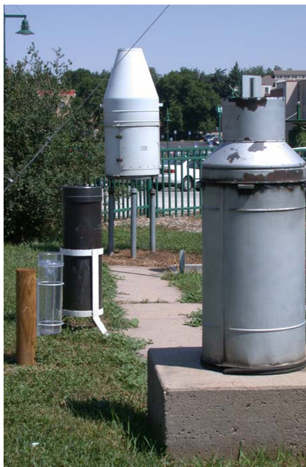
Figure 1. Example rain gauges at the Fort Collins, Colorado, National Weather Service Historical Climate Network weather station 05-3005-4.